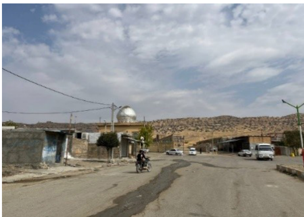
Fig. 4. The widened main axis of the entrance of Abulofa village leading to the shrine.

the implementation of development plans is selective and there is a lack of consistency in their trajectories for achieving economic growth. Although the shrine of Abu al-Wafa plays an important role in the socio-ritual dimensions of the place, its development plan is not included in the rural development plans. Among other village development plans, the Hadi plan has only focused on the physical dimensions, improving the road network and urban structures, and such a difference in focus in the plans has resulted in disjointed and uncoordinated development, leading to a lack of growth and balanced development in this village.