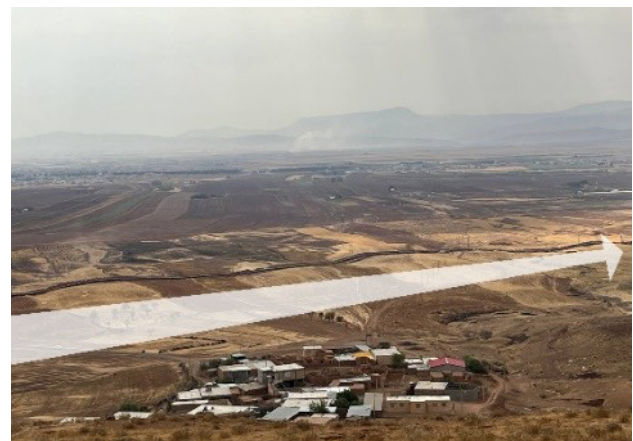
Fig. 2. The passage of gas pipelines through the agricultural lands in the village of Sorkhdom has caused land division and damage to the lifestyles of the villagers.

The multiplicity of rural development plans and different operators are among the basic problems in Abu al-Wafa village. The reason is that the Endowment Administration is in charge of shrine development while the Housing Foundation is in charge of rural affairs, and the structure of plans, this has resulted in selective choices and decisions based on different tastes. Awqaf as the administrator of the development of the shrine in Abu al-Wafa village selectively focuses on the form and geographical area of the shrine and implements development plans to attract tourists and pilgrims (Figs. 3 & 4). The main focus of this type of development is the improvement and expansion of the shrine regardless of the location and economic aspects of the village. This development approach has exclusively focused on religious areas and operates independently of the economic and social needs and characteristics of the village, which has contributed to the mechanization of the village. At first, this development can be a kind of balanced development from a social point of view, but according to Khorasani and Mohammadi's article (2021), the general poverty index situation in Abu al-Wafa village is on a downward trend. This statistic shows