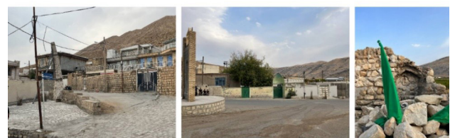
Fig. 6. identity and social elements of Khosroabad village (right to left: Babaslam Fire Temple, neighborhood center, mill).