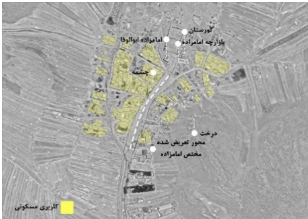
Fig. 3. The aerial map of Abu al-Wafa village and existing social and identity markers.