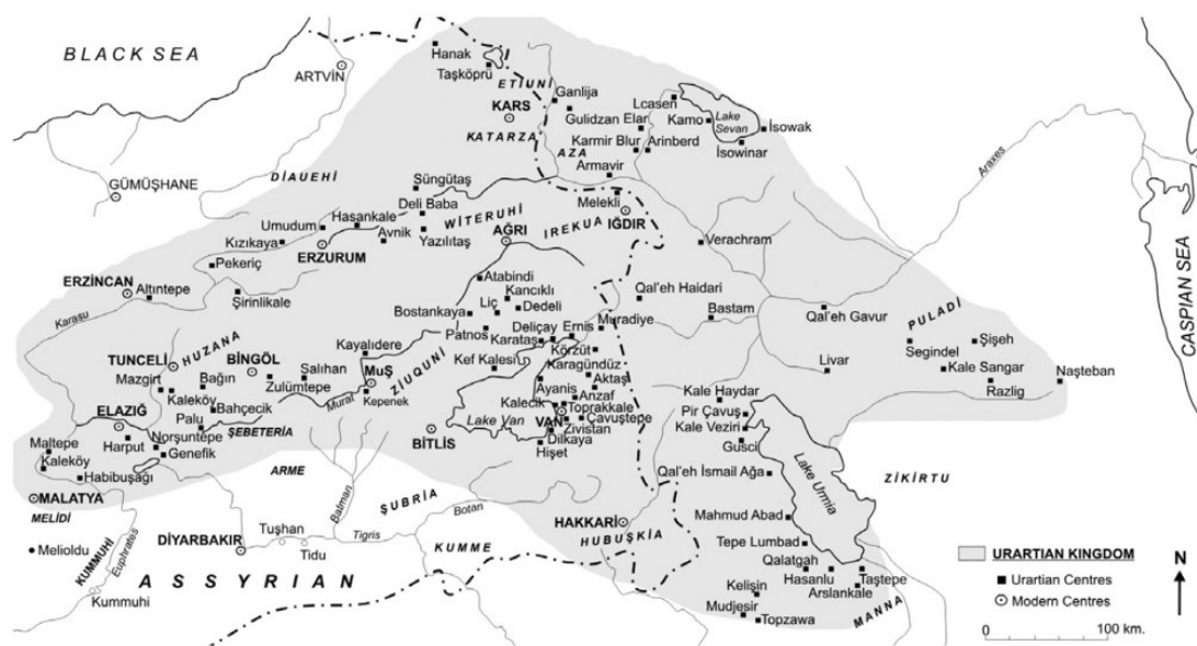
Fig. 1. The Urartian kingdom and its sphere of influence and expansion. Source: Gökce et al., 2012, 107.

community (religion-centered) (Konakçı, 2006, 32). The Urartu state, in the regions it expanded into, also had gods that, according to this inscription, were added to its pantheon of deities. This passage describes the acceptance of the gods of the people of lands where significant population shifts have been imposed by the government of Urartu. The inscriptions belonging to Ishpuini, the inscriptions of castle buildings ordered by him, are mostly found in Tushpa, the capital, and its surroundings such as Zivstankale, Aşağı Anzaf, and Patnos (Çilingiroğlu, 1997, 28). The Kasimoğulları inscription indicates that the Urartians campaigned to the northern and northeastern regions of Lake Van, and areas such as Anaşe, Eturiki, Lusha, and Katarza were conquered (Payne, 2006, 37; Pehlivan, 2013, 198). Based on these inscriptions, it can be inferred that population transfers occurred as a result of northern expeditions, and groups of men and women were likely moved from the city of Anaşe to Van and its surroundings (Konakçı, 2006, 20). Ishpuini conquered Parsua in northwestern Iran with a campaign (Çilingiroğlu, 1997, 30), and with this campaign, Ishpuini and Menua began their military operations in the basin of Lake Urmia. Information about this military campaign can be identified from the Karagündüz inscription. The Urartu government also carried out a population transfer