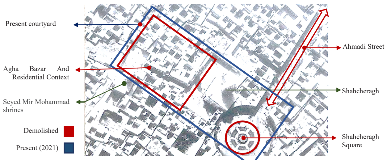
Fig. 1. Shahchareh area before developing the courtyard and connecting it to the two sacred shrines of Mir Ahmad and Mir Mohammad.