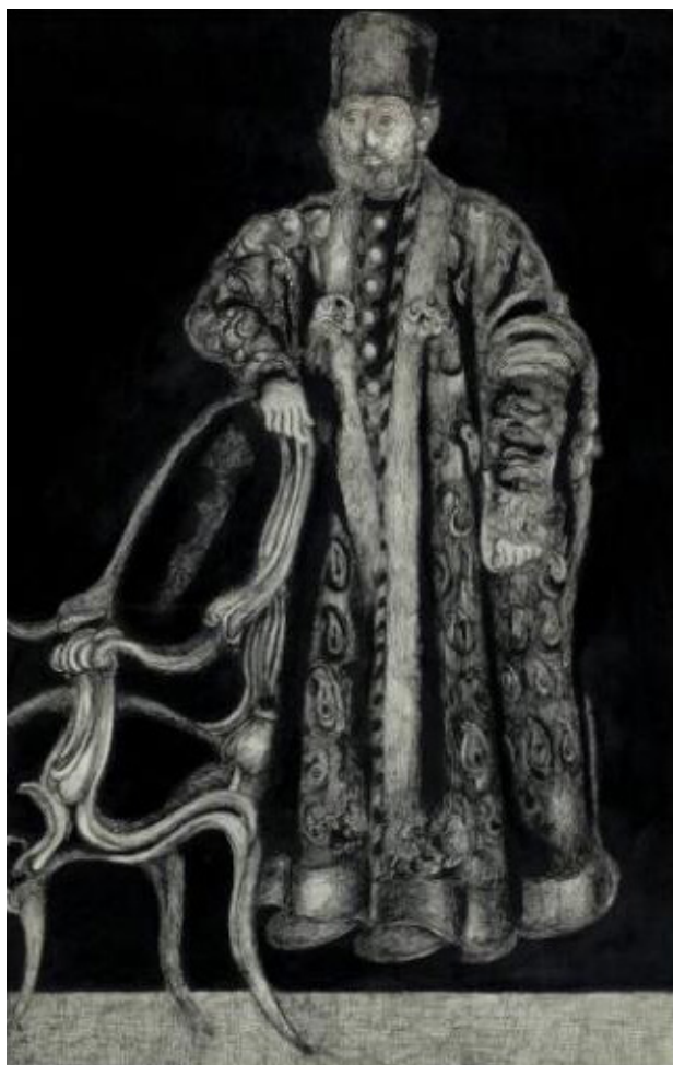
Fig. 2. Qajarmans, Ardeshtir Mohases, ink on paper.

his hand. But this picture shows a woman in its background. I am looking for masculinity.