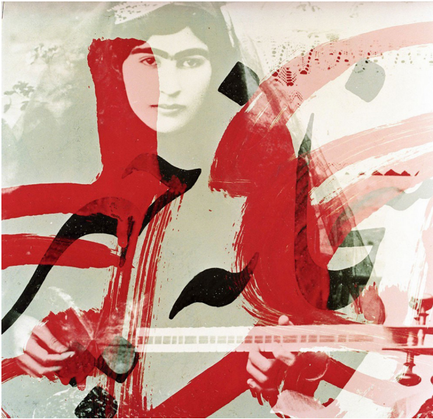
Fig. 3. Imagination, Bahman Jalali, Photography.