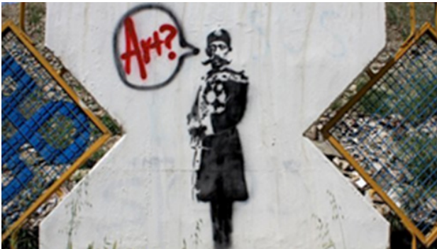
Fig. 5. Qajar man, unknown artist, graffiti.