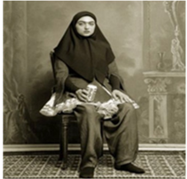
Fig. 4. Qajar album, Shadi Ghadirian, 2002, Photography.