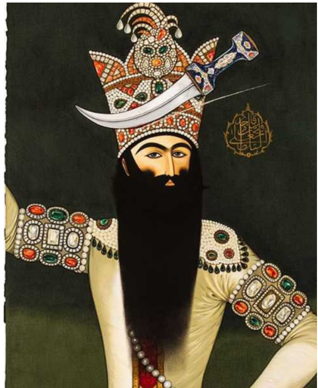
Fig. 1. Destruction Memories, Aydin Aghdashlu, 1979, Gouache on paper.

Ardeshtir Mohases, through using technical methods of graphics and combining these with Contemporary art, succeeded in creating a language that is familiar, bitter, dark, independent, and unique. His works began with a caricature in the Tofigh Magazine during the 60s. Through presenting sketches including dark ironies full of tiny hatchings and by displacing members of the human body Mohases has a very critical look at the Qajar period. In some of his works, the chronicles of flattery age and Qajar icons are no more than an allegory. Mohases delineates a drama that is in opposition to Modernism; among characters and customs which represent Qajar traditions. His caricatures show his contrast towards barbarism of the time, bureaucracy, and the social gap which are not based on human values. Characters wear fine