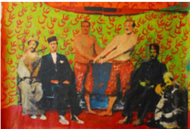
Fig. 9. Pahlavan, Khosrow hassanzadeh, 2006, mix media on canvas.