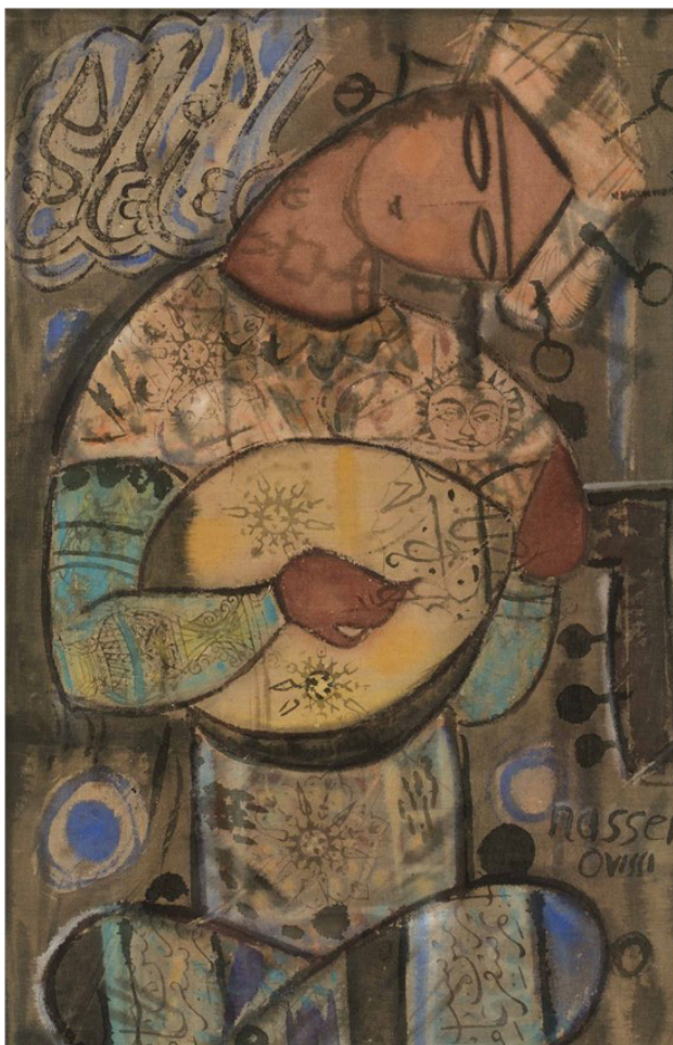
Fig. 7. Player, Naser Ovisi, 1961, oil on canvas.