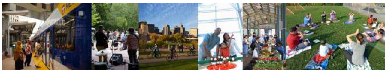
Fig. 3. Voluntary and Willing Human Presence the most Important Factor in Vibrant City of Saint Paul, Source: https://www.stpaul.gov .

cities). If we refer to Golkar's definition, most of these researchers have paid attention to the micro-criteria of vitality and theorists in more developed countries than Iran have paid attention to the macro-criteria of vitality such as regional economy dynamics, cultural and tourist exchange and citizens' interactions with the government. This difference indicates that the criteria for vitality are indigenous concepts (Fig. 3). From another point of view, attention to contemporary vitality criteria such as healthy economic competition, social solidarity, inclusive and sustainable neighborhood units, bilateral and long-term interaction between government and city council, political interactions and cultural dynamism leads to a positive and effective presence of people in urban spaces and not merely their presence in space that can sometimes be devoid of quality. Consider, for example, a street where a large number of pedestrians pass through which, but the most common activity they do is to watch the shops. Namely, if this presence in space can be more effective, more conscious and more passionate, and not just a passive presence. In fact,