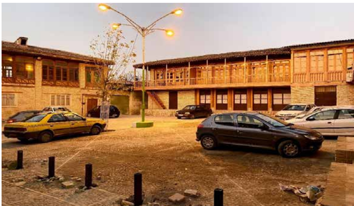
Fig. 3. A variety of materials and extraversion dimension of grains in the neighborhoods of Gorgan, Photo: Sara Shokooh, 2020.

function of 'Tekiyeh' which seems to have been built in the Qajar Period (Mousavi Serwineh Bagh et al., 2015). Neighborhood centers in Gorgan are so intertwined with 'Tekiyeh' that they are sometimes used interchangeably – For instance,