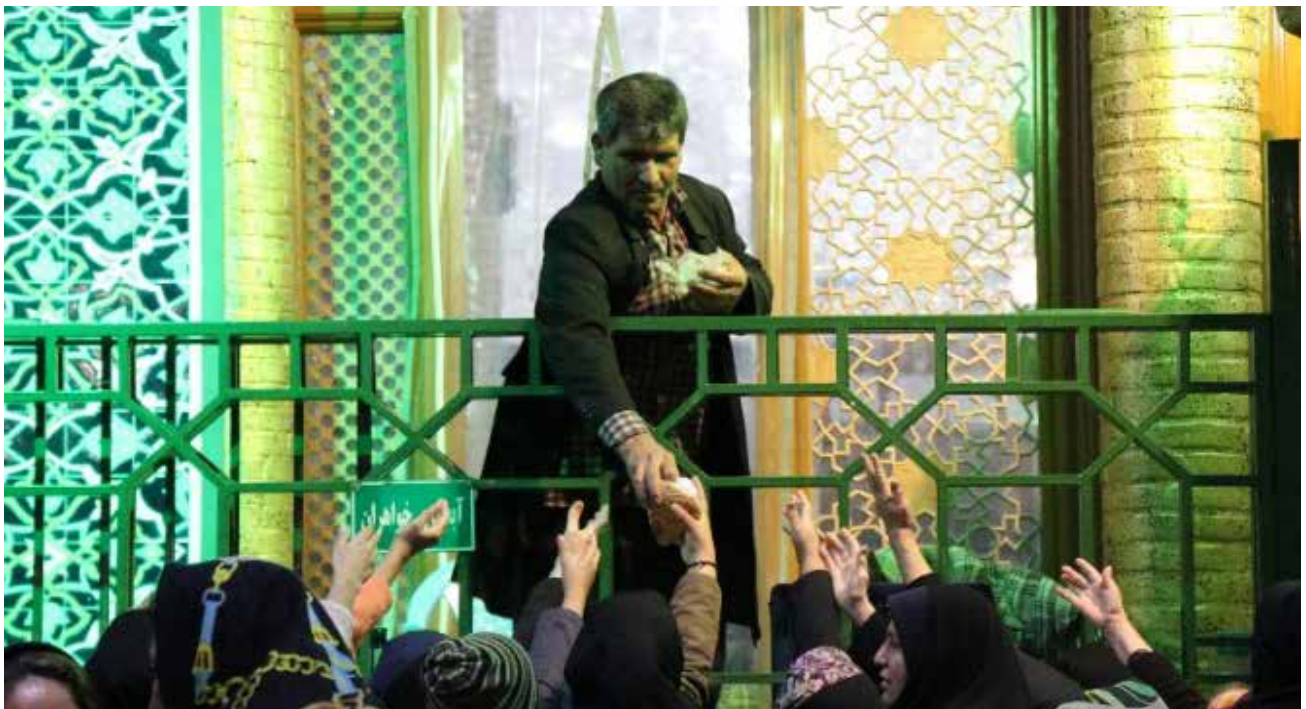
Fig. 7. Tekiyeh Sayed Abbas Ali. Photo: Azarnush Amiri, 2020.