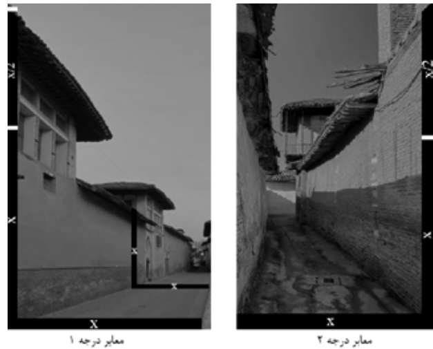
Fig. 4. The densities of existing buildings range from 1 to 2 stories and the width of passages vary from 3 to 3.5 meters. In second-rate arteries the ratio varies between 1.5 and 3 because the passages are approximately 2 m wide.

it is difficult to mark a boundary between Abbas Ali Takiyeh and Sabzeh Mashad. Gorgan’s Tekiyehs share similarities in terms of location and their bodies. All are on the upper floors and have a transparent body facing the center. What is remarkable is the life sustainability promoted by its religious function (Tekiyeh 3 ) rather than other neighborhood functions. Nazif (2011) says: “Although spaces such as tank-houses, baths, and inns have virtually lost their values due to different social conditions nowadays, religious spaces such as mosques and particularly Takiyehs have continued to play a key role in the sustainability of neighborhood centers”. Other residential landscape elements are “residential grains”. The houses in the alleys of Gorgan’s neighborhoods - unlike Yazd and Kashan -are extravert and their second floor having a distinctive body facing the southern forest landscapes. In addition, their functional extraversion has added variety to materials and forms in the “alley” view by influencing the body. The proportions, materials, and techniques used in this climate - wood, brick,