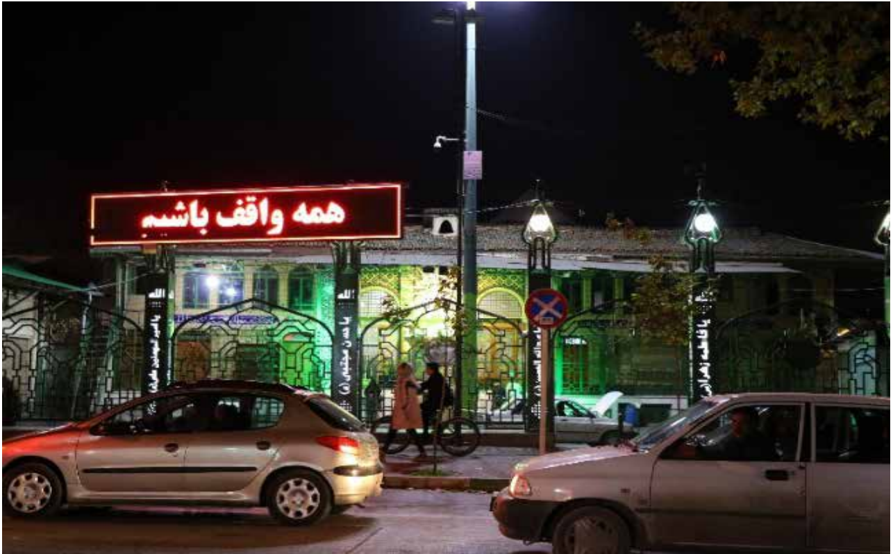
Fig. 6. The importance of devotion: The entrance of Sayyed Abbas Ali's Tekiyeh.