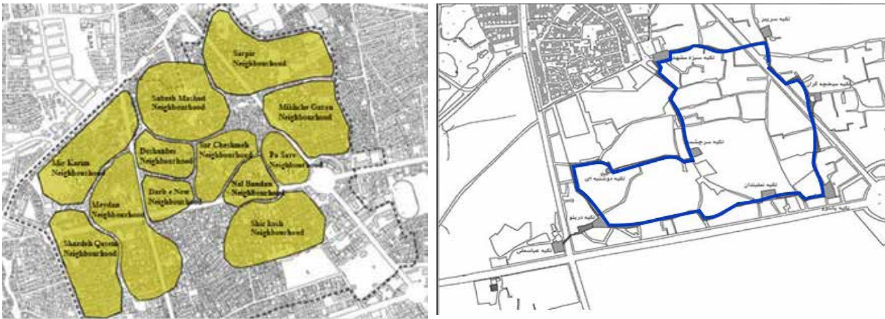
Fig. 2. Right: Public path of Mourning Groups in Gorgan City From the Third to the Sixth Night of Muharram. Left: Boundaries of the Historical Neighborhoods in Gorgan.

ending neighborhood centers are generally leveled to provide a sociable platform. In addition, slopes are clearly leveled in areas such as houses, mosques, and etc to create a place where people can rest and constantly gather. Therefore, passageways such as alleys and neighborhood crossings are only places where this natural event occurs. The second element is the presence of water infrastructure. Neighborhood elements are places where people are provided with services based on the underwater infrastructure. The neighborhoods of Gorgan are located on the beds of about 80 aqueducts, which both provides water and determines the location of the landscape. Also, the provision of public utilities including historic baths (e.g. Mikhchegaran, Ghazi and Dabaghan), tank-houses (e.g. Mirkarim) aqueducts (e.g. Sabzeh Mashhad, Sare-khajeh) and the use of specific names (e.g. Sar chesmeh stands for spring in English) for neighbourhood suggest a rising water flow that is a component of Gorgan's landscape.