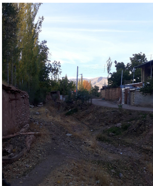
Fig. 4. Accessibility and main route in Kamoo village. Photo: Farshad Bahrami, 2018.