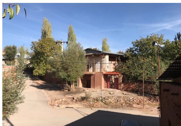
Fig. 1. Development of masters' houses in Kamoo riverine.

The river, recognized as the main natural component of the village, emanates from the Karkas mountain range and intrushes to this village and Choghan village located along Kamoo village. The river movement in trough line of the valley creates a befitting condition for village development. Accordingly, the linear structure of the village along the river produces a social hierarchy. Thus, not only physically but also semantically does the river create a concept representing a class system. That is, the houses belonging to dignities and masters are in upstream and the houses belonging to farmers are located in downstream (Fig. 1). The development of this architecture type along the river current from the source to fields illustrates a kind of power and class system of masters and farmers. The construction of dignities' houses in upstream is due to their convenient access to more as well as clean water sources. In other words, more dominance over water sources shows more power among the village inhabitants.