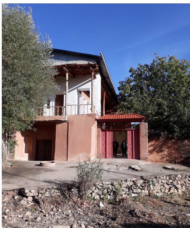
Fig. 3. Development of terrace or verandas overlooking the Kamoo river.

hierarchies in this village. The river is a symbol of power—that is—the more dominance over the water (the river), the more power. Hence, houses and architectural pieces are closer to the river compared to farmlands. The social hierarchy, as a different order or hierarchy shows the effect of social dignity—master and farmer in this village. The development of this hierarchy based on social power over a natural element (river) shows the dependence and high effect of the components of natural appearances in the villages of Iran. In addition, attention to rivers in different spectrums including architecture, location of the village center in water borders, the route and main road of village in water borders (along river current), etc. depicts its importance as a subjective-objective element—landscape.