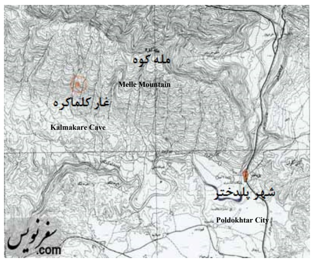
Fig2. Map of the Clymakra Cave.

Lack of pursuing his alleged ei=ghteen-year time period