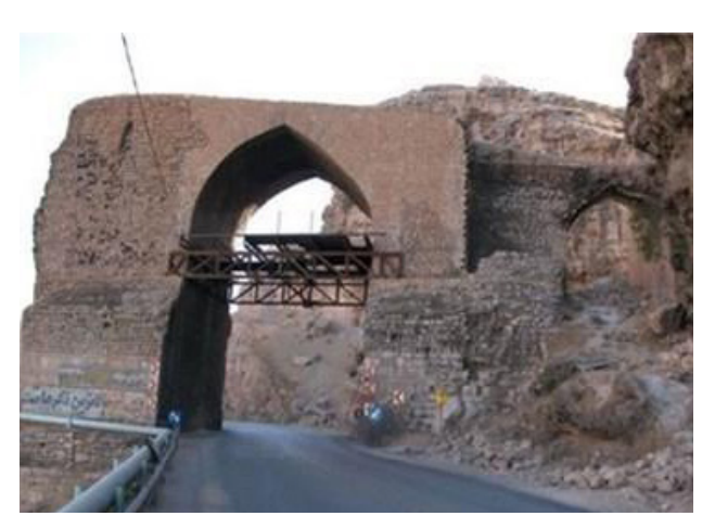
Fig.5. Poldokhtar district 5 km east of Kolmakra.

According to Yaghout, etymology of the 'Mehrjan Ghazagh' consists of three elements of 'Mehr' as sun, affection and compassion; 'Jan' referring to the soul; and 'Ghazagh' derived from the name of a 'man' (Yaghout, 1965: 4/698). Beside his oversight about the meanings 'Jan' and 'Ghazagh', it can be stated that the meaning