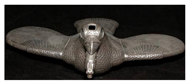
Fig.7. Waterfalls, animal rites or holy sprinklers.