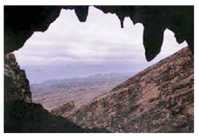
Fig.3. Calypso Cave's mouth.