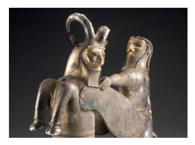
Fig.4. Muzzle.

powered. Further, she wore the foliage (Coman, 2001: Razi, 1980: 62). Thus, it is inferred that the <u>traditional</u> and mystical concept of the Toponym "Kalmakare" is closely connected to Mithraism.