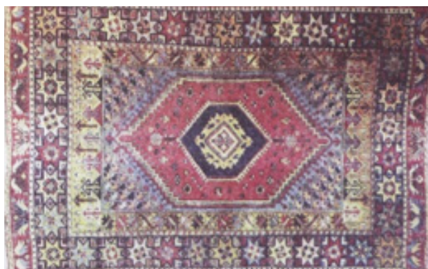
Fig.13. Nomad rug Middle Atlas, Source: Mojabi, 2009.