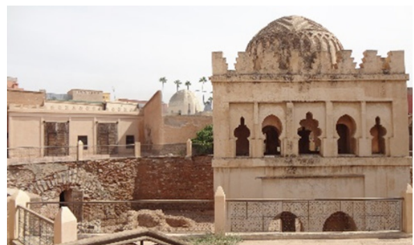
Figs. 3 & 4. The use of crenel in skyline of non-military buildings (mosques, schools and minarets and...), Photo: Danesh Taherabadi, 2016.