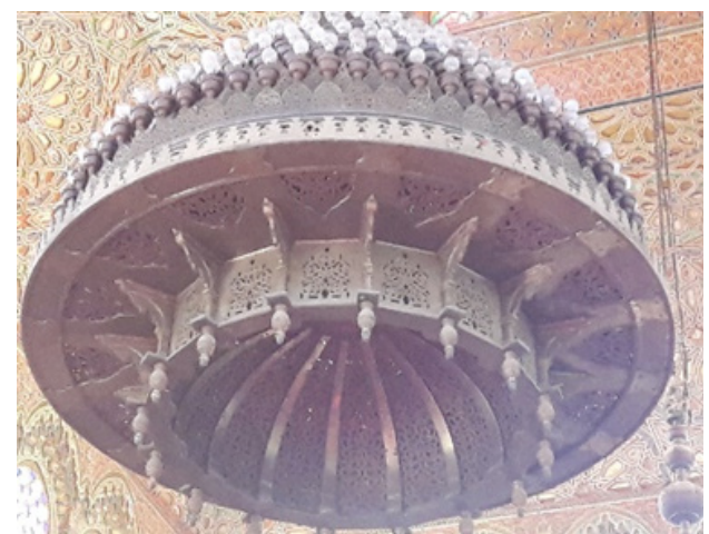
Figs. 9 & 10. use of crenel in Moroccan knitted products pattern.