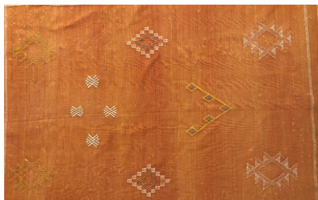
Fig.15. Moroccan crochet design, Photo: Shohreh Javadi, 2016.