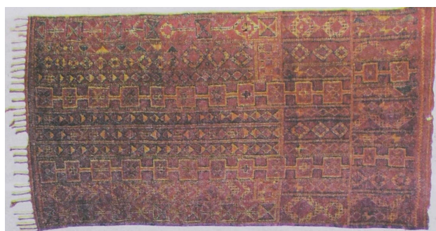
Fig.14. Namur carpet, Source: Mojabi, 2009.