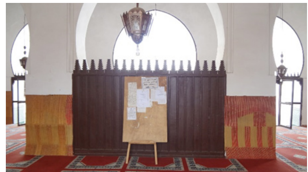
Figs. 7 & 8. use of crenel in woodcrafts.