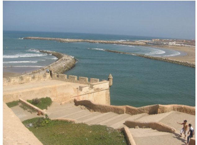
Figs .1 & 2. Use of crenel in Morocco's defensive fortifications (the origin of crenel), Photo: DaneshTaherabadi, 2016.