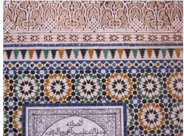
Figs 5 & 6. Use of creel in Moroccan tiling.