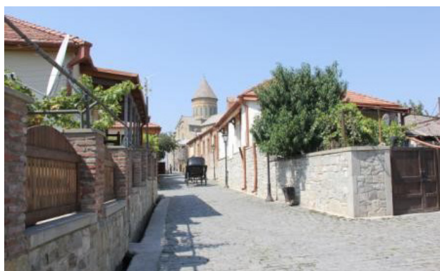
Fig.1. A view of the renovated sidewalks in the city of Metshtah. Adopting the tourist approach to the renovation has turned the city into a museum and lifeless city. Photo: Ehsan Dizani. 2014.

New approaches to urban restoration have unanimously come to this decisive conclusion that, “the absence of a merely physical perspective” in renovating worn-out textures may not be the only reason guarantee the success of renovation, but its overlooking would result in the failure of a renovation project. This issue has been addressed in defining and describing worn-out textures: “these textures are characterized as unstable and poor in physical, functional, motional, environmental, socioeconomic and managerial aspects” (Falamaki, 2009: 99). Renovation experiences have shown that emphasizing the physical aspect of the restoration and renovation of worn out- textures only results in the creation of a crust devoid of texture that gradually collapses in the absence of life and will be prone to destruction. This approach transforms the worn-out texture into a corpse which seems to be perfect from outside,