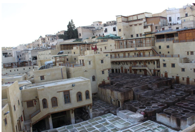
Fig.2. Tanneries, one of the sites of traditional products, in Morocco, are the workplaces for a particular group of people. They are preserved at the heart of the historic texture of the city, "Fez" and serve as a platform for some activities.

Although there is a consensus that some issues