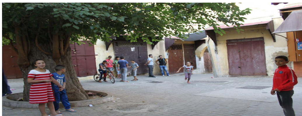
Fig. 4. The continuity of the urban life in one of the neighborhoods of the city of Meknes with its residents in the middle-class area of the urban community. 2017.

namely the need for maintaining attention to the physical aspect of city and life of citizens simultaneously in the dominating approach to modernization, we can conclude that renovation and intervention in worn-out textures require the consideration of different aspects of the lives of citizens. For this reason, this process is called the urban regeneration. “Today, the goal of urban regeneration is to consider the complexity and dynamism of the city. Urban regeneration is a multidimensional project that relates to different urban situations in different time periods; in this process, the past, present, and future are simultaneously analyzed” (Hosseini & Sotoudeh, 2014). Obviously, paying attention to all aspects is not an easy and short-term issue. In other words, modernization will be more successful if more dimensions are taken into account. In the theory of balanced modernization, this issue is interpreted as “successive divisions.” “The successive divisions are the smallest unit for detecting, identifying and measuring the balance in the networks, dimensions, components, and indices of the renovating texture system” (Andlib, 2017) The more we include the successive divisions and deeper we analyze them, the better we can measure and identify of the balance in the texture, we would achieve a greater success in modernization.