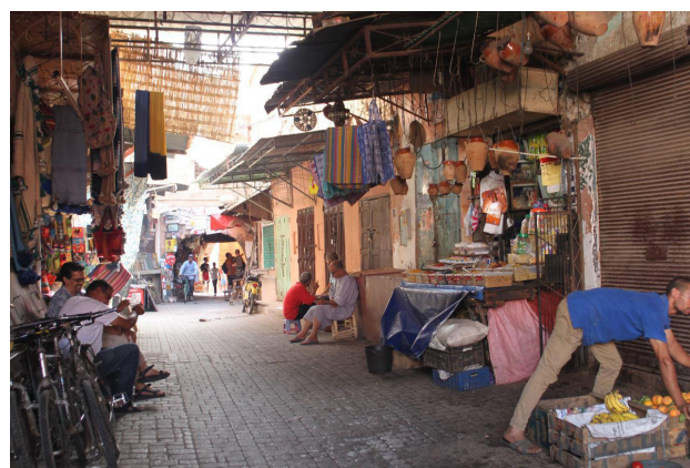
Fig. 3. A traditional market in the city of Medina serving the needs of the residents of Medina. Photo: Reyhaneh Hojjati. 2017.

such as maintaining the attention to the flow of life and urban life, as well as not adopting a merely physical look for restoring worn-out textures can address the issue of balance, such consensus is barely reflected at the operational level in the historical centers. The lack of consensus has led to various approaches such as urban refinement, social planning, economic planning, urban centering, and protectionism-based reconstruction (Ghhorbanian, 2010). Addressing the different