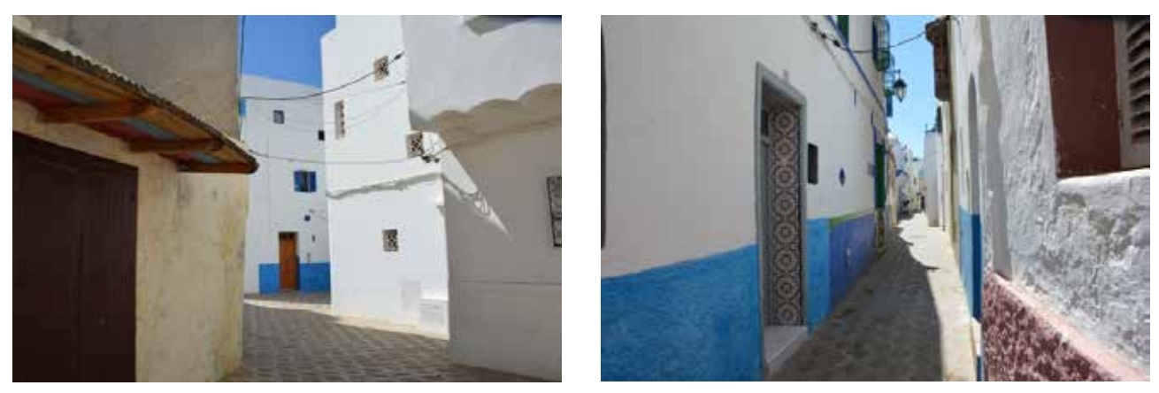
Fig. 4. the quiet passages Asilah medinah.

Focusing on public spaces, this program has struggled to preserve the liveliness of the texture. As such, through the visiting of Asilah's medinah, positive features of the texture were recognizable. Among these features, enhanced situation and regulation of the public spaces can be mentioned. Accordingly, open public spaces are visible in the texture that simultaneously lead to social interactions and balance the density of historical texture. Among the other distinguished factors are the renovation of public passages and the improvement of their flooring. For an improved beautification of urban spaces, a wavelike model (kind of reference to the ocean on the beach of which the city is established) is applied on the flooring of the streets (Fig. 6).