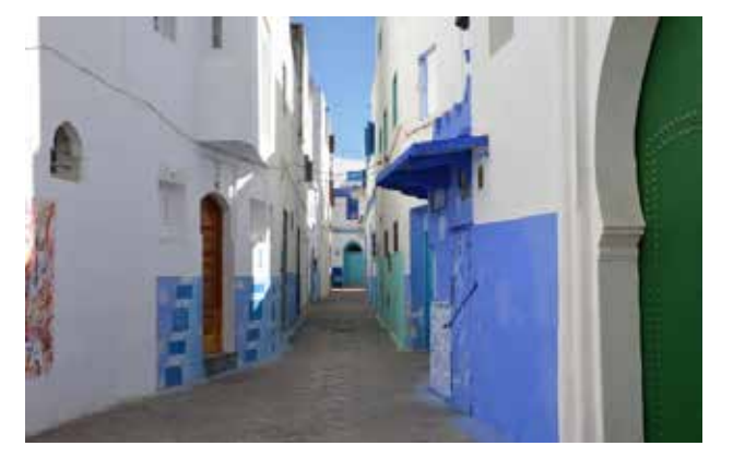
Fig. 13. The dramatization of historical texture.Photo: soheil Esgandarzadeh, 2016.

Besides, in economic dimension, this project has imposed negative effects on the texture. Among these effects are rising cost of living, rising land prices, income volatility, and the appearance of self-seekers and false occupations (The Aga Khan Award for Architecture, 1989).