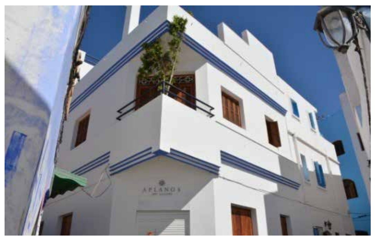
Fig. 10. The dedication of usages appropriate for tourism industry in the texture.