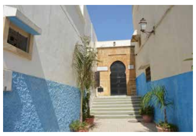
Fig. 7. The diversity of architecture in the historical texture.

Among the other positive factors deserving to be mentioned are the improvement of urban view and the improvement of residential areas through the renovation of the houses which are exposed to destruction. Reconstruction is solely possible within the areas bordered by walls. New buildings follow the same style of the historical Spanish and Portuguese buildings. The beams and columns are made of reinforced concrete and in some parts brick barrier walls are set. The roofs consist of iron beams and hollow bricks. The most common material of the walls are concrete and hollow brick. The exterior view is shaped by concrete covered by lime. Usually, tiles with traditional decorations and wooden pieces from Cedar trees are used in renovation. It is noteworthy that in the present and usable