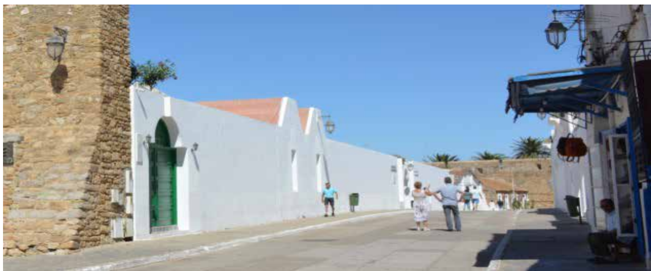
Fig. 14. The fading identity of the neighborhood and its passiveness.