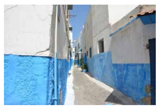
Fig. 8. The improvement of the floorings of streets. Photo: soheil Esgandarzadeh, 2016.