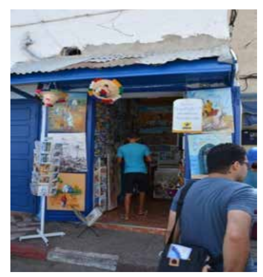
Fig. 12. The creation of jobs for residents. Photo: soheil Esgandarzadeh, 2016.

handcrafting commercial functions are anticipated within the historical texture.