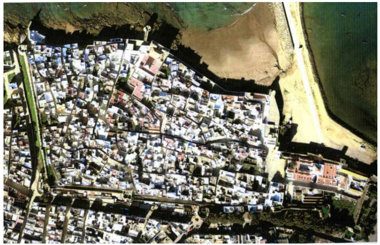
Fig. 2. An aerial photo from Asilah's historical texture.

The historical elements and buildings of the medinah were reconstructed during the revival of it. In addition, the development of substructures and urban facilities are the other cases observable in the city. Throughout the medinah, the