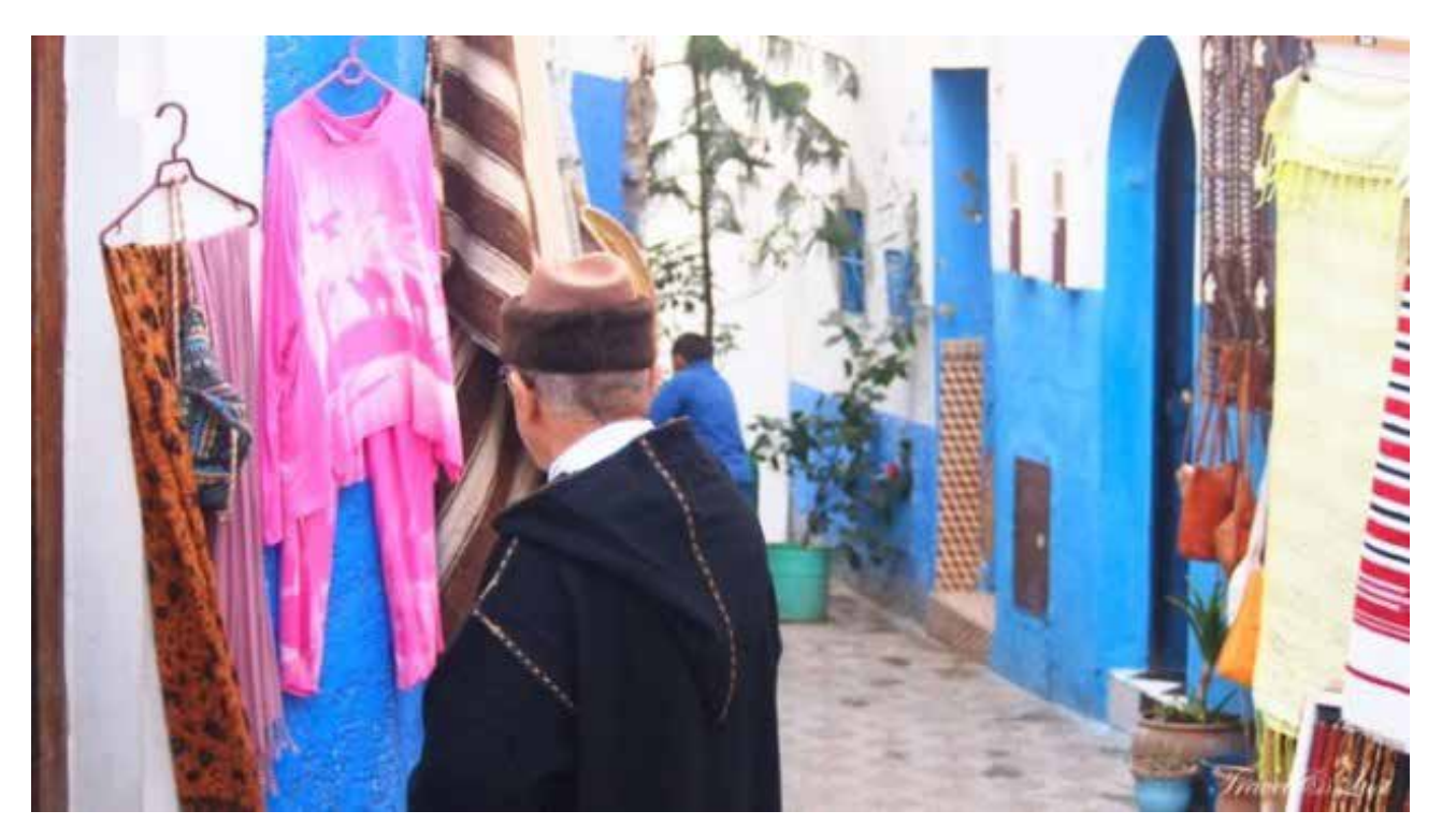
Fig. 9. The placement of the handcraft selling shops in the texture.