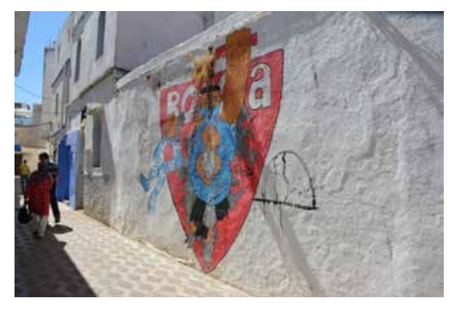
Fig. 5. The wall paintings on the urban walls.

Among the other positive factors deserving to be mentioned are the improvement of urban view and the improvement of residential areas through the renovation of the houses which are exposed to destruction. Reconstruction is solely possible within the areas bordered by walls. New buildings follow the same style of the historical Spanish and Portuguese buildings. The beams and columns are made of reinforced concrete and in some parts brick barrier walls are set. The roofs consist of iron beams and hollow bricks. The most common material of the walls are concrete and hollow brick. The exterior view is shaped by concrete covered by lime. Usually, tiles with traditional decorations and wooden pieces from Cedar trees are used in renovation. It is noteworthy that in the present and usable