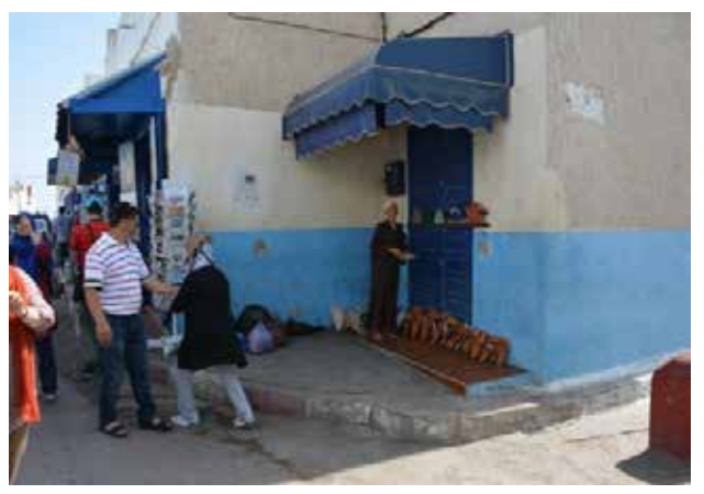
Fig. 11. The creation of business related to tourism industry.Photo: soheil Esgandarzadeh, 2016.

The improvement of other urban substructures such as water, electricity, and telephone networks are other positive points seen in the historical texture of the city. In this way, the improvement of city's public lighting, electricity and telephone network has expanded the commercial and touristic activities in the region. Furthermore, the prediction of sewer collection system and waste collection one has increased the quality of urban atmosphere (ibid). Another observable case is the improvement of urban equipment in a way that buildings with social, educational, and