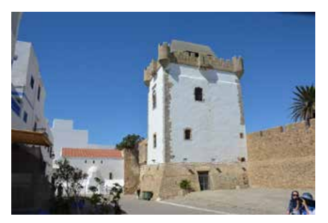
Fig. 3. Raisouni Palace. Photo: soheil Esgandarzadeh, 2016.

The Effects of the Revival Project of Asilah's Historical Texture on the City's Local Landscape As it was explained, the revival of Asilah's historical texture is done by giving priority to tourism industry. Due to this, variety of positive