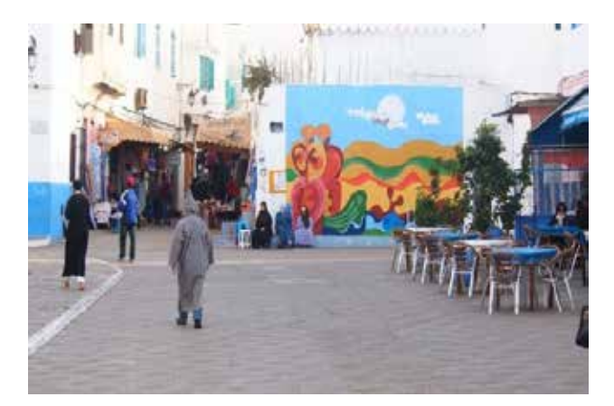
Fig. 6. Considering the creation of public spaces in the texture.

In Asilah medinah's texture, the change in the function of historical buildings and the insertion of new services into it for addressing both citizens' daily needs and that of tourism industry is recognizable. For instance, Raisouni Palace is changed into a cultural complex and spaces like studios are prepared there to host artists and tourists during the big artistic-cultural festival. Further, an amphitheater within the Portuguese walls, an anchorage in the existing port for the expansion of commercial activities and, finally, a small beach resort in the coast of the ocean are constructed. In addition, some functional places such as cafes and restaurants are added