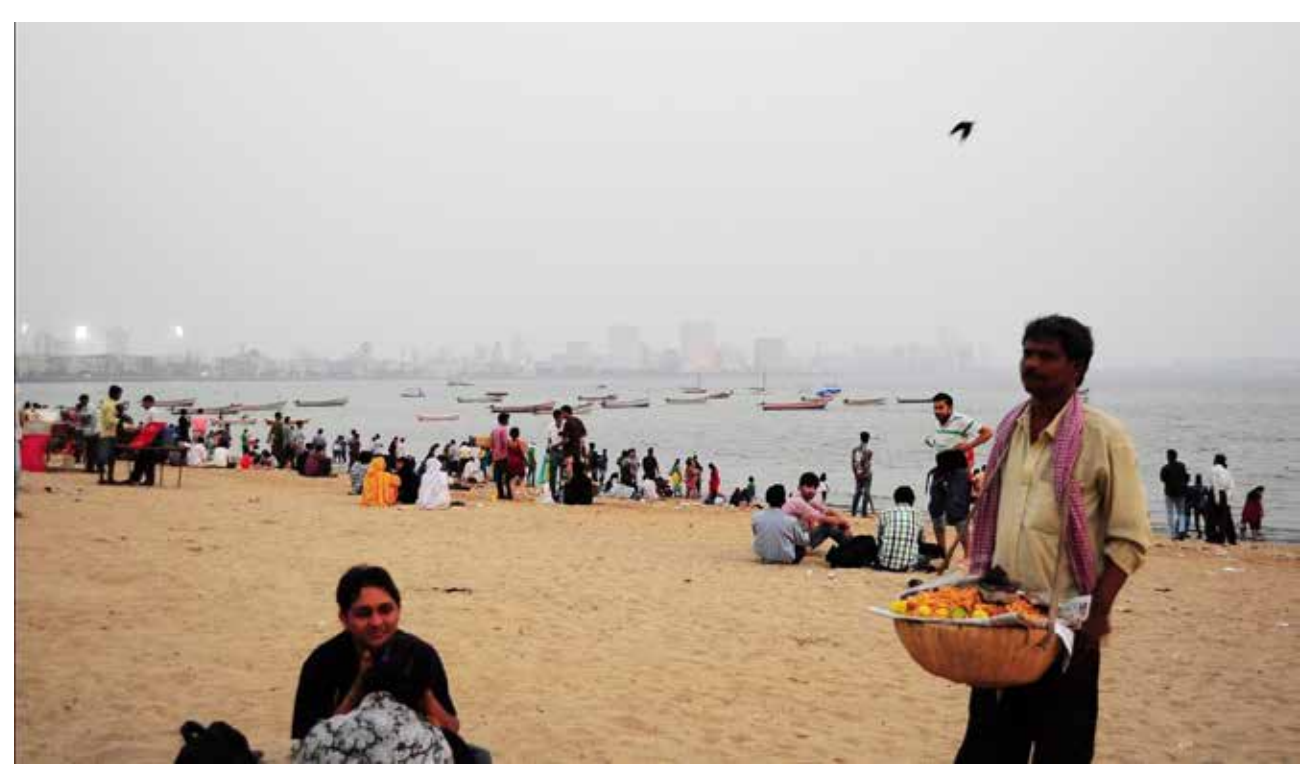
Fig.4. The presence of people, peddlers, birds and different activities on the seashores of Arabian Sea. photo: Zahra Askarzadeh,1391.