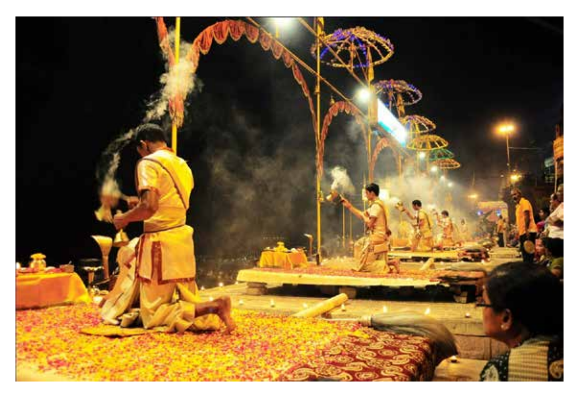
Fig. 3. Performance of ritual ceremonies at sunset and gathering of people along Ganga River. Photo: Zahra Askarzadeh,2011.