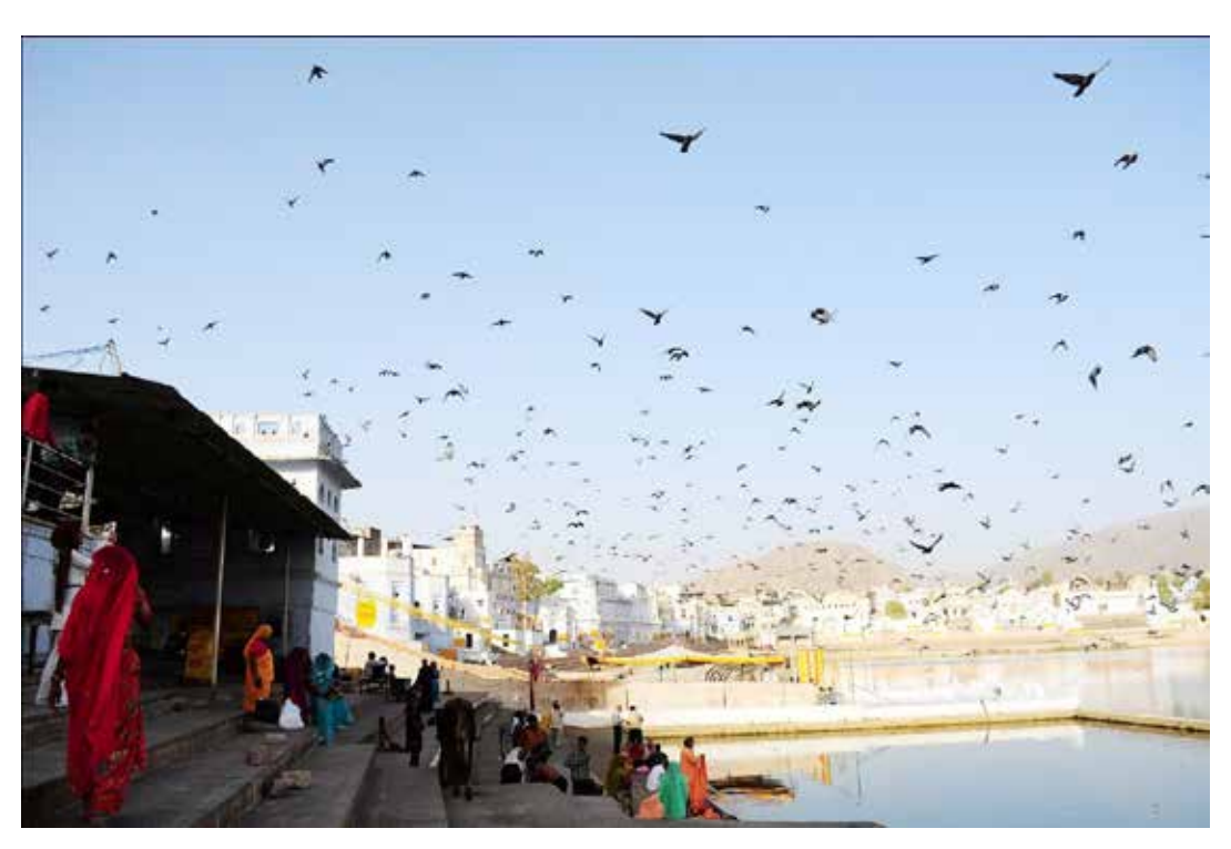
Fig. 2. The presence of buildings, residents as well as birds around Pushkar Lake, Photo: Zahra Askarzadeh, 2011.

According to field observations, Ganga river-