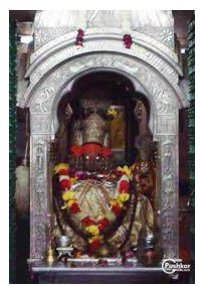
Fig. 4. Brahma, A temple in Pushkar.