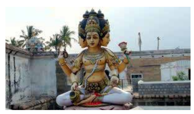
Fig. 7. Brahma, A temple near Tamil Nadu.