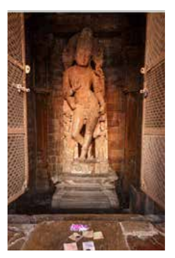
Fig. 9. Vishnu, Chaturbhuja temple in khajuraho.