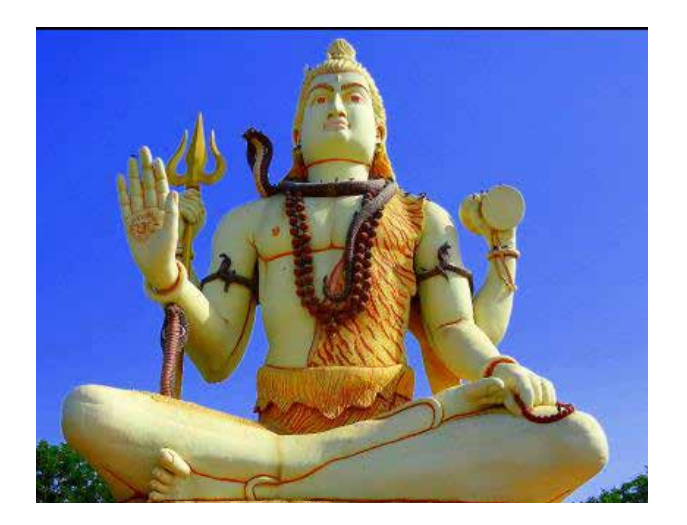
Fig. 27. Shiva, Nageshwar temple, in Jamnagar, Gujrat.