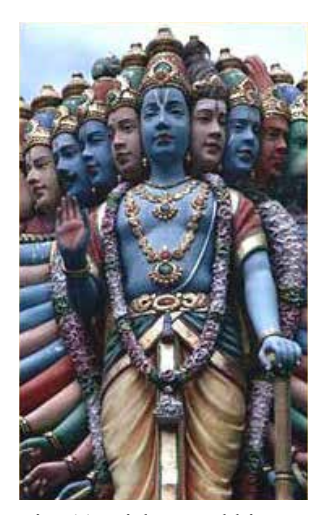
Fig. 11. Vishnu and his avatar.