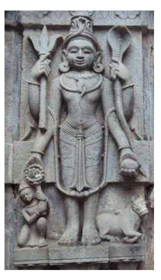
Fig. 21. Shiva, A temple in Delhi. Photo: Shohreh Javadi, 2012.