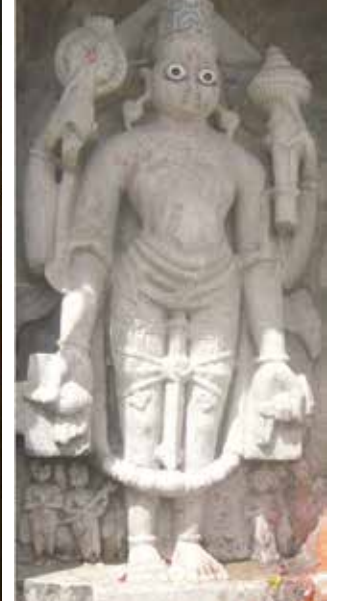
Fig. 16. Vishnu, A temple in Jeypore. Photo: Shohreh Javadi, 2012.