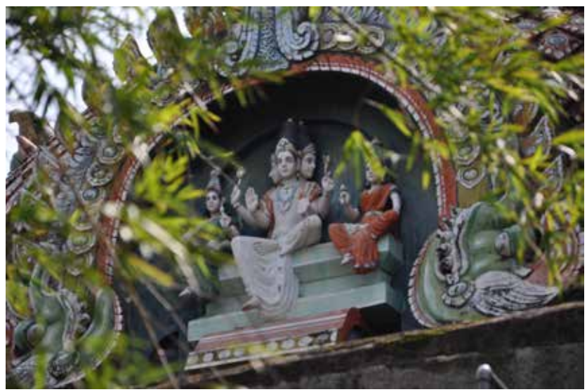
Fig. 5. Brahma, Sirkazhi temple in Tamil Nadu.