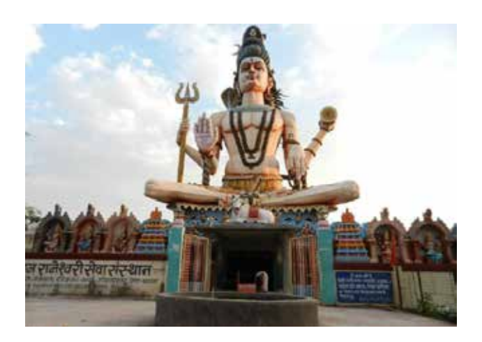
Fig. 33. Shiva, Omkareshwar temple, 2007 A. D. in Madhya Pradesh.

Shiva signs include: third eye, cobra necklaces, disheveled hair, moon crescent, the holy Ganges, drums, Vibuti (Vibuti means three lines of ashes drawn on the forehead that represents the essence of human evils: ignorance, selfishness and violence), ash, elephants and deer skin, Rudraksha and trident.