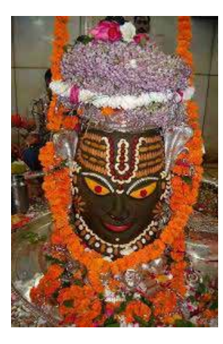
Fig. 29. Shiva, Mahakaleshwar temple, in Ujjain, Madhya Pradesh.