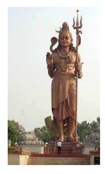
Fig. 23. Shiva, Vaidyanath temple in deogarh, jharkhand.