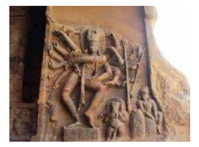
Fig. 20. Shiva, 9 B. C.

"Shiva" is similar to "Rudra" both in features and appearance and manifestations. He has many followers among Hindus by inheriting from ancient Rudra. "Rudra" is one of gods