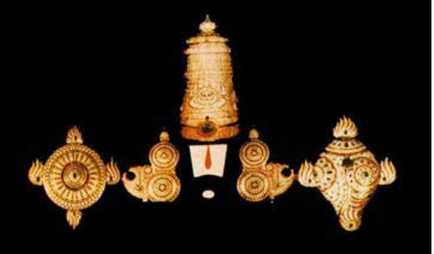
Fig. 19. Signs of Vishnu.