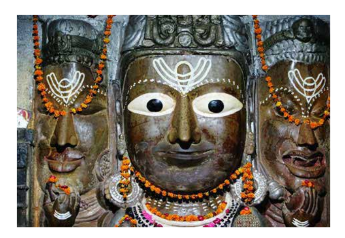
Fig. 30. Shiva, Samadhishwar temple, in Chittorgarh-Rajasthan.