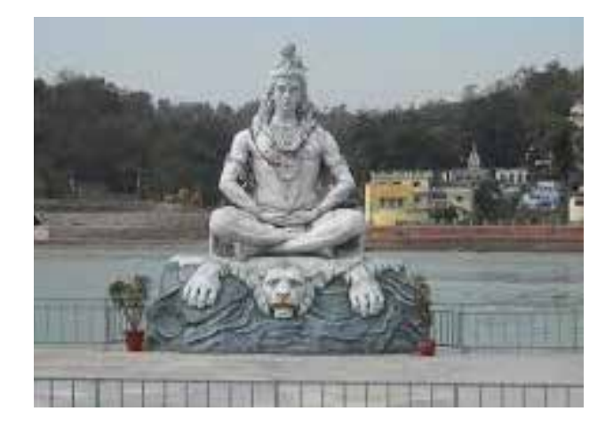
Fig. 25. Shiva, Kedarnath temple, 8th century A. D in Uttarakhand.

that are mentioned in "Rig Veda". His name is always shining in a cloud of anger and rage. He is a bloodthirsty and furious god that can destroy the Earth by his movements. Although he issues the order of fever and diseases, he is a healer as well as (Zekrgoo, 1998: 194). Shiva is also the