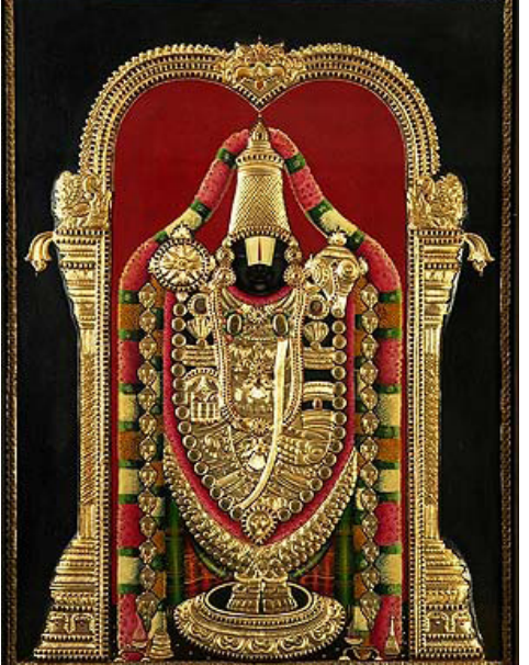
Fig. 15. Vishnu, Tirupati Tirumala Balaji temple.

guardian or supporter. This characteristic led to a conclusion that all super powers to protect and support are belong to him (JalaliNaiini, 2006: 117:122). He comes in different colors, especially white and black and brown and red, blue. In most images, Vishnu is shown as a young man with a cheerful face and four hands (Fig. 8-19).