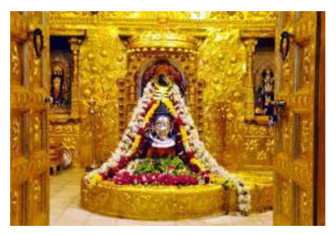
Fig. 31. Shiva, somnath temple, in Gojarat.

Fig. 29. Shiva, Mahakaleshwar temple, in Ujjain, Madhya Pradesh.