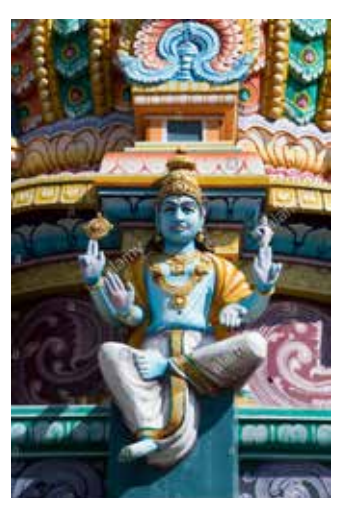
Fig. 10. Vishnu, gopuram temple in indiasur.