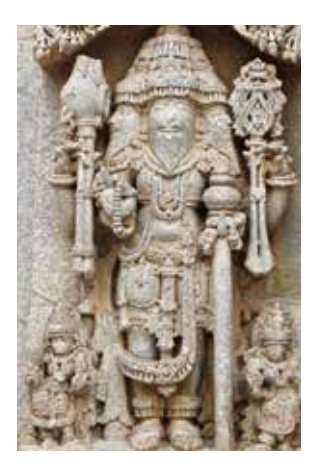
Fig. 2. Brahma, Chennakesava temple in Somanathapura_ Karnataka.

Brahma is god of creation and is considered as the almighty creator. There are only 6 temples for him throughout India. He is known as Hindu god of gods that has no activity on the Earth after creating the universe. He is the creator of the objectives of the world (Naas, 1991: 277). In the cosmology of Purana, creation is resulted from the heat of Brahma austerity. Based on MatsiePurana, Brahma came out of lotus flower and asked: "who am I? What is this lotus that has emerged in privacy of infinite horizons and is floating on infinite waters? Perhaps a creature is holding it. Then, he entered the lotus stalk to find its end. After a while, he understood that there is no end. So, he returned and started thinking.