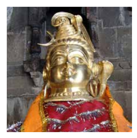
Fig. 32 Shiva, tryambakeshwar temple.