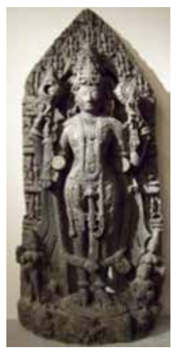
Fig. 8. Vishnu, Guimet museum.