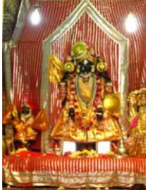
Fig. 17. Vishnu, A temple in Udaipur. Photo: Shohreh Javadi, 2012.