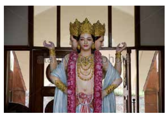
Fig. 6. Brahma, iskon temple in delhi-uttar-pradesh.