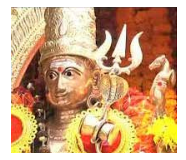
Fig. 28. Shiva, Mallikarjuna Swamy temple, in Srisailam, Andhra Pradesh.