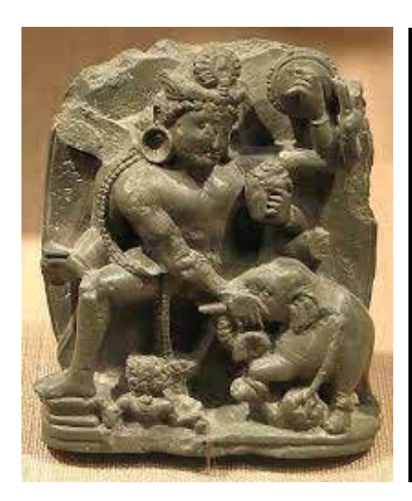
Fig. 18. Vishnu, Rescuing Gajendra temple in Jammu & Kashmir. 8-9 A. D.