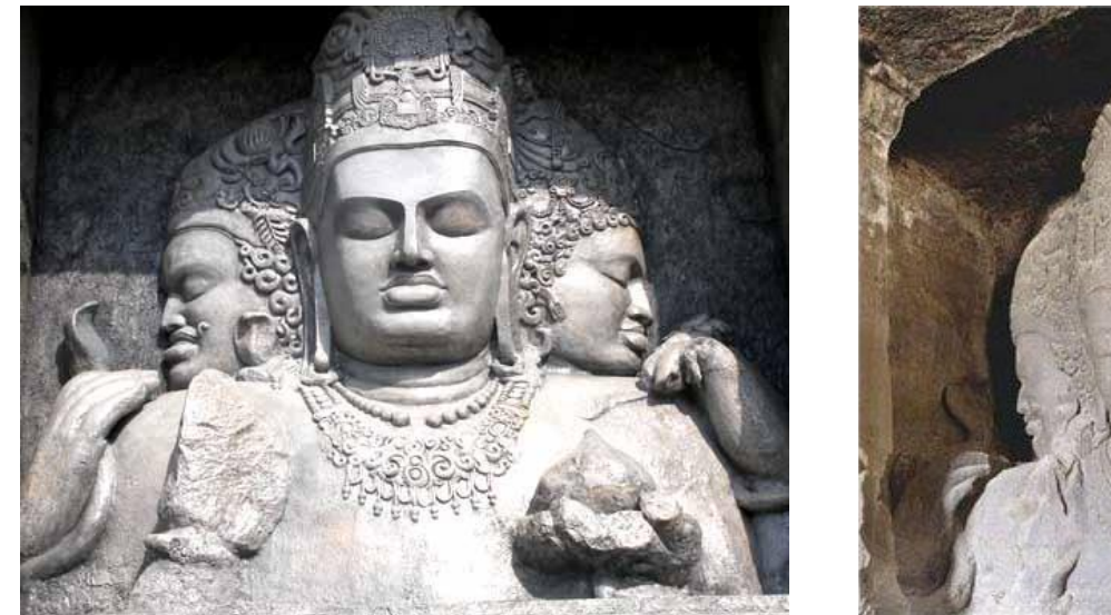
Fig.1. Trimurti, a temple in Alfanta caves, 6th Century AD.

D) Middle Hinduism or Medieval Hinduism, since 500 AD to 1800AD: Religious sources that emerged during this period include books of philosophical schools triple religions literatures that express the opinions and worship manners. In this period, Brahman is more significant, so that other gods were considered as Maya and illusion. Some Hindus knew them as the