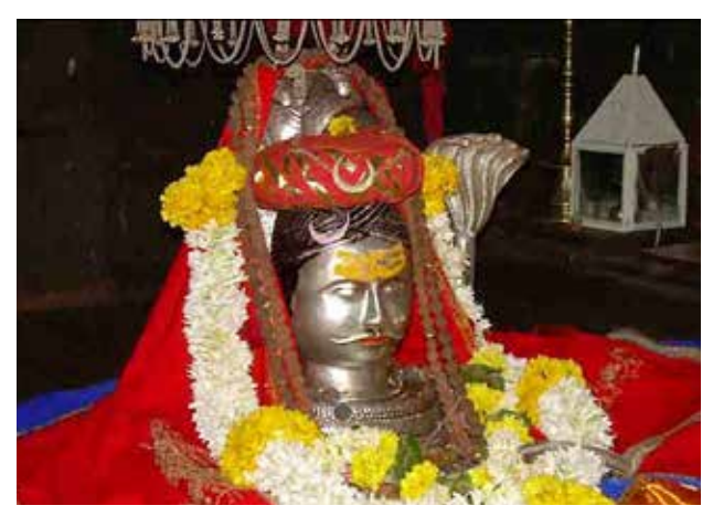
Fig. 26. Shiva, Bhimashankar temple, 13th century A. D in Pune, Maharashtra.

that are mentioned in "Rig Veda". His name is always shining in a cloud of anger and rage. He is a bloodthirsty and furious god that can destroy the Earth by his movements. Although he issues the order of fever and diseases, he is a healer as well as (Zekrgoo, 1998: 194). Shiva is also the