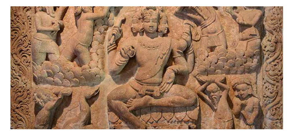
Fig. 3. Brahma, Ceiling of huchchappaiyya-gudi temple in aiholebijapur.