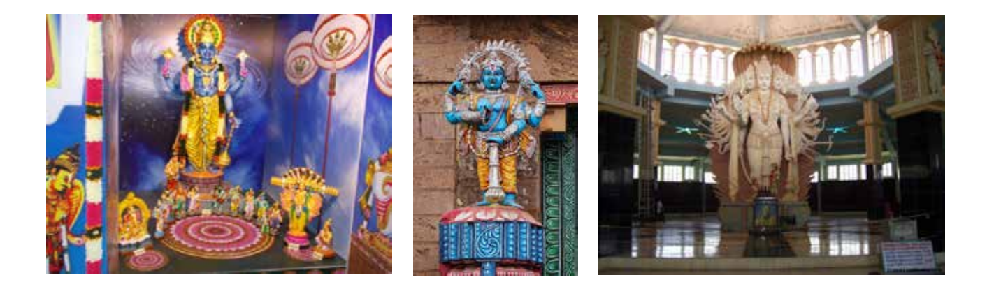
Fig. 12. Vishnu, Srirangam Ranganathaswamy temple in Tiruchirappalli, Tamil Nadu.

Vishnu is of the significant gods in "Rig Veda" that is called preserver god and is considered as the connective force between components of the world. He is a very kind god that preserves the universe and ensures the continuity of universe. In recent Hindu religion, he is always considered as the preservative principle. Several hymns in praise of Vishnu and his greatness are mentioned in "Rig Veda". There are more hymns about Vishnu's perfection (such as being eternal, being omnipotent, being pure and sublime, omniscience and etc.) in religious texts. He is the symbol of the sun and can pace the seven district of the world in just 3 steps. He can surround everything with his light. We read in first Mandalay, hymn 154 (Rig Veda): "he kept the high place and paced triple zones with long paces. All the creatures have their homes among these three long paces. He can preserve this universe and all creatures in their place by his own power. In some schools of Veda, Vishnu is