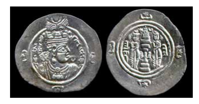
Fig. 2. Yazdgerd III Coin, the last king of the Sassanid, Mint of Estakhr city.