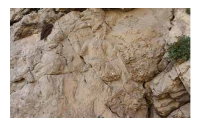
Fig.1. Relief of the water goddess -Anahita, near Lake Prishu-Fars.

This Historical and valuable bas-relief, Parisho, is one of the numerable samples of ancient Iranian females which was left unattended and without any physical protection (Bahar newspaper