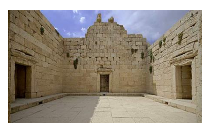
Fig. 3. Anahita temple, Bishapour -Fars.