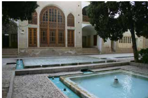
Fig. 4. Fin Garden, Spiritual influence of Paradise can be understood by the presence of precious natural elements such as water in the garden.

of streams forms. Therefore, by this description of paradise in Quran not as a form of expression and assigned to the Persian garden forms and forms of Paradise not from scientific logic; But cannot ignore the impact of semantic paradise in the garden, because people are looking for comfort space where the best places are the paradise; therefore it is not inconceivable that the Iranians attributed to paradise, very beautiful spaces of gardens (Fig. 4). In the end; must be searched in other places the cause of the special geometry Persian Garden means the straight line orthogonal axes, study on the primary roots of Persian garden discover real archetype will open the way for greater recognition of this phenomenon.