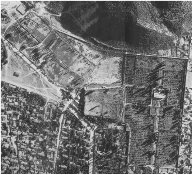
Fig. 3. In many gardens, there are no basically quartet design and garden as dams located on sloping land.

Persian gardens in the aftermath of Islam will be the result of an allegory of Paradise in the Quran (four streams of Paradise) and the ancient man vision to Earth as an analogy from nature” ( Diba , 1995: 28); four streams of Paradise is mentioned in the Quran. “Classical Persian gardens always follow this rule. Canals were built of surrounding trees and flowers. Surrounding waterways are places full of trees and flowers. There are pools or home gardens in place the intersection of waterways and rivers” (Adryan Fon Rocoez, 2002:97); Rivers flow