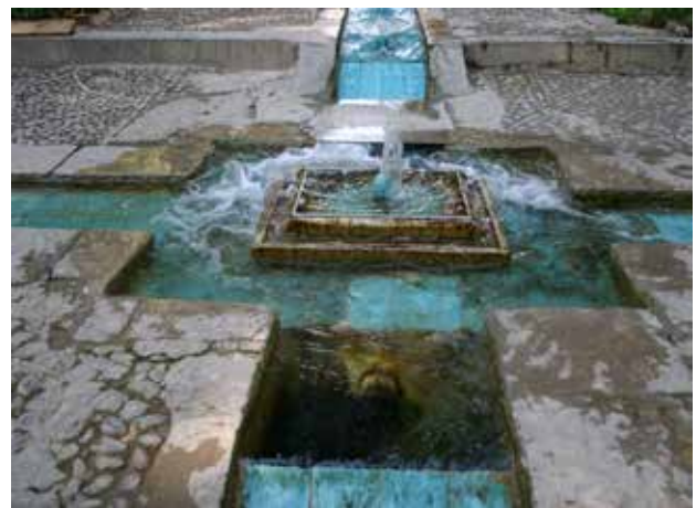
Fig. 2. In the ideal case, and in the details of a garden, the water enters from one direction and exits to the three other directions, Photo: Vahid Heidarnattaj, 2008.

There has been no trace and sign of the divided world into four parts by delves into Iranian's ancient texts such as Avesta; the religious teachings of Zoroaster in Avesta is most written