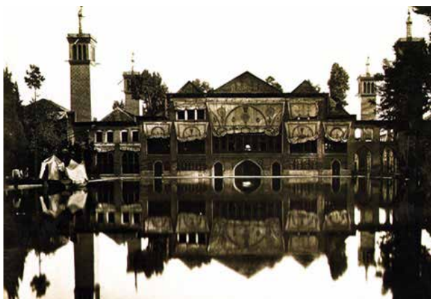
Fig.1. fountain in the main Badgeir building and in front of the palace

complete set for each of the five senses and rich in nature, which is brought together. Some writings from the past is describing human emotions about Persian Garden. As Babrshah described Kabol city and its gardens: "Landscape of mountains, valleys and forests and gardens is so beautiful that imagine the beauty is quite satisfied the human desire" (Wilber, 2003: 78). The sense of sight as an important and decisive sense is satisfied with detailed and logical plan, planting in the garden, blossoms of fruit trees, flowers and evergreen trees and shrubs in Persian Garden. The winter landscape is also rich by planting trees such as red willow, yellow jasmine and pussy. The blossoms as an element of meaning in the other arts, such as film used. Persian Garden depicts the visually dynamic landscape to the cycle of bloom - fruit - fall - Bloom. It represents the cycle of life - death - life, and is reminiscent of the time through the sense of sight. If all evergreen trees are planted, remembering the time will not be directly and fast. Planting plants growing time and Blooming sooner than others, as the Bellwether is an effort of Iranian Garden artist embody the transposition.