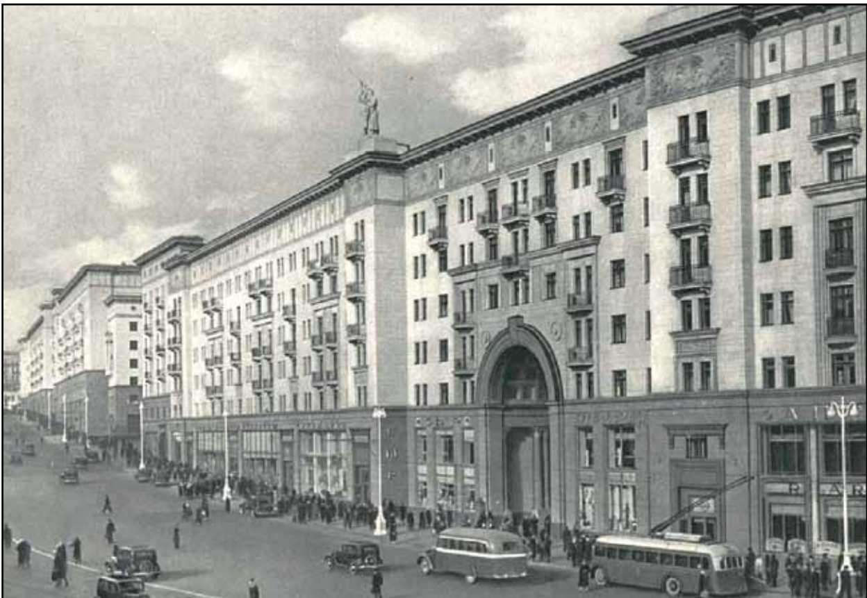
Fig.3. The architecture includes the entire history of the city's Gorky Street: Institute of Marx, Engels and Lenin (1926), building a telegraph (1927), a national monument building that members of the Soviet government and the families were in place, Old luxury hotel in the years before the war and until 1943 the communist militants and the staff was welcoming, luxurious restaurants, the historic statue of Prince Yuri Dvlgvrky years before the revolution and founder of the legendary city of Moscow. Gorky Street in the late 1930s.

ings damaged that were had no architectural and artistic importance and replaced in the great buildings: combination of Italian Renaissance architecture and the architecture of the Russian Empire created. Other buildings that were important isolated from its foundation, and on a set of railroad track to the new site. Gorky Street looked much as it does today and was referred to as the "Champs Elysées" of Moscow. Gorky Street is a triumph of the Bolsheviks in architecture; where the Series of regular columns and capitals of Leningrad House originated of Classicism and Renaissance in Italy (Kopp, 1989: 28); (Fig. 3). The sculptures can be seen above the buildings do not represent the Greek and Roman mythological gods; They are real or imaginary heroes of the Russian industrial and economic plan includes statues of workers, peasants and soldiers of the Red Army, a witness to an era in which it was attempted reconciliation between architecture and social goals emerge. Street in the socialist city is a product of Hasty action by the central government to achieve justice, that create