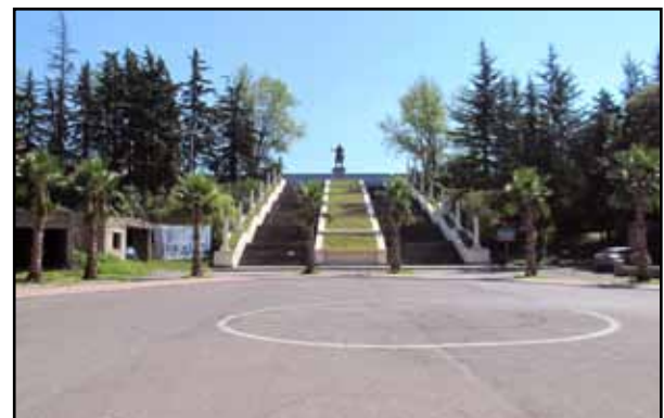
Fig.4. David Agmashenebeli Avenue in city of kutaisi, the height of the authoritarian of regime was thinking by creating a large-scale Statue of David, King of Georgia David, the builder.

Independence of the Caucasus can be seen as the beginning of modernism in the streets due to the floor and the furniture. During this period, although the concept of street depends on to the physical elements but this time, as during the communist planning structure, geometry and scale solution isn't considered It focuses on the use of materials, colors and modern products on the floor and walls over the street. The physical changes in this period are accession of the modern elements such as signs, advertising panels and furniture made to imitate the West. In Tbilisi, Rustaveli Avenue with its grandeur and glory of communism, the main street of the cities is the best areas for today's Caucasus approach. Despite the famous brands, luxury shops and boards, modern restaurants and a large advertising panels, the streets is empty of urban life and only the passage of the machine (Fig. 5). Additionally urban furniture are located in urban space to imitate European example in form, materials and colors to present the modern face of the city (Fig. 6). Main Street City Zugdidi is just a passing street;