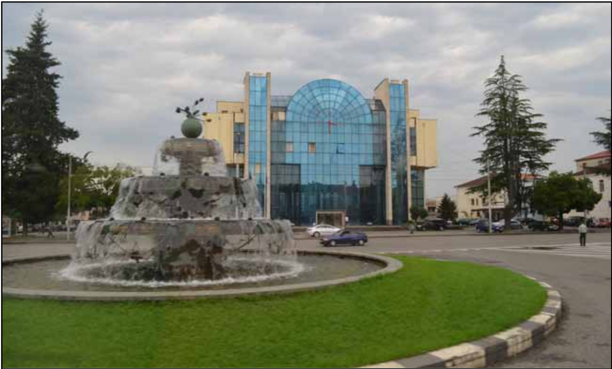
Fig.1. Poti is an obvious example of a socialist city where communal space has not any place in it, and only large-scale urban spaces present in it. Photo: Zohre Shirazi, archive of NAZAR research center, 2013.