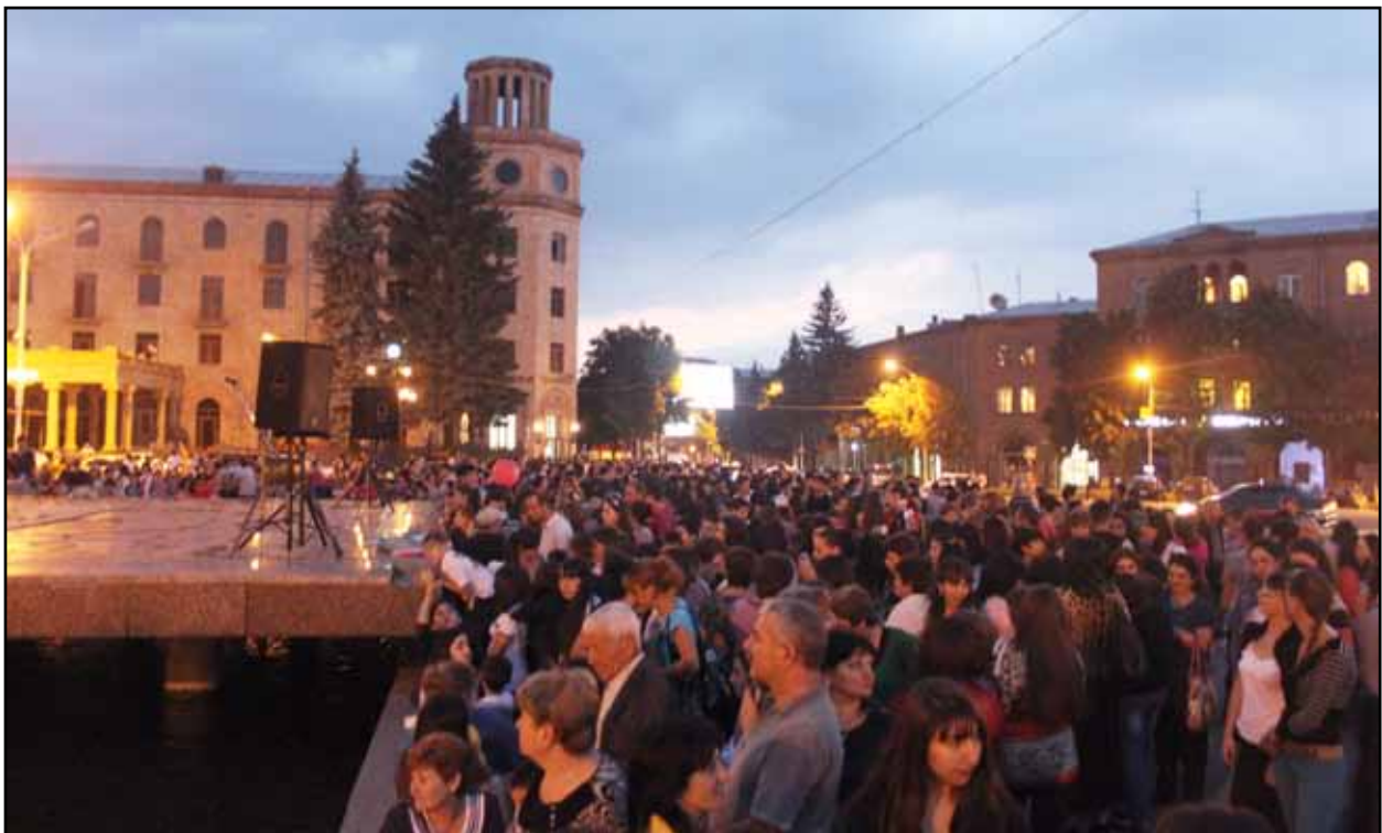
Fig.5. The lack of suitable and proper design in organizing communal spaces of Vanadzor city has led to inconsistency between people needs and spaces. Downtown Vanadzor, Armenia. Photo: Reyhane Hojjati, archive of NAZAR research center, 2013.

Maybe it seems that the main reason for the failure of communal spaces is undesirable basis arose dur-