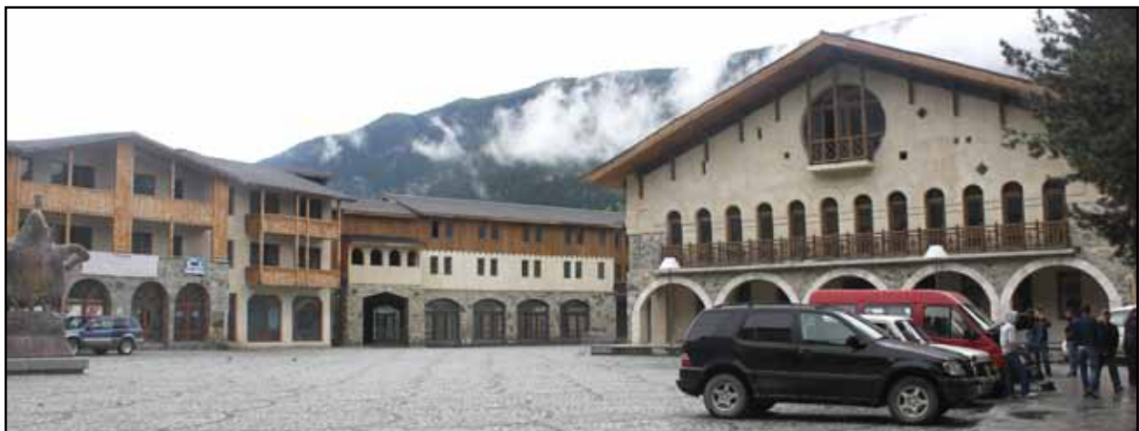
Fig.9. Downtown Mestia is solely a superficial imitation of western models and the appropriate actions to create interaction between the citizens are not considered, Georgia. Photo: Reyhane Hojjati, archive of NAZAR research center, 2013.