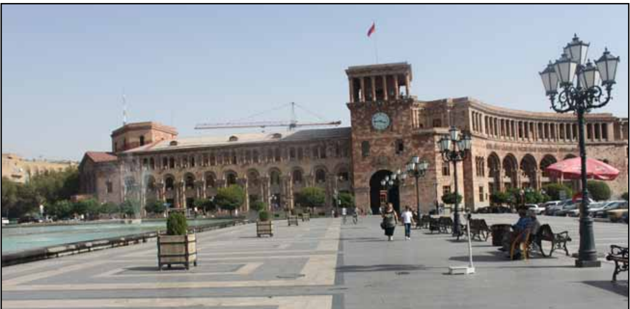
Figs.6 & 7. The poorly designed communal space of Republic square of Yerevan is causes the emptiness of space and lake of passerby during the day, Armenia.

ing the Soviet Union regimen. But in Mestia - one of the touristy cities in Georgia- which maintained its traditional context during the Soviet regime, there are a similar approach to management of city landscape and its European model. In this small town, the central area of the city which has played the role of the communal space in the past was lost its traditional features in the overall structure and function due to recent restoration. Large buildings with wide entrance and business applications in which most of them are empty and without prosperity and the use of furniture with European models are all product of Western-centric approach to