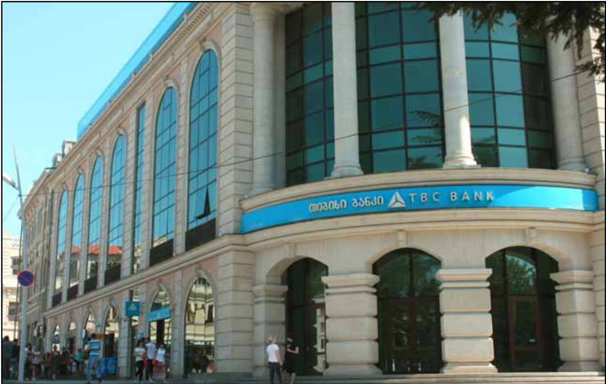
Fig.3. Application of western classical architecture and imitative furniture in Kutaisi downtown in Georgia represents an approach which seeks to join the world and European system, Georgia. Photo: Reyhane Hojjati, archive of NAZAR research center, 2013.