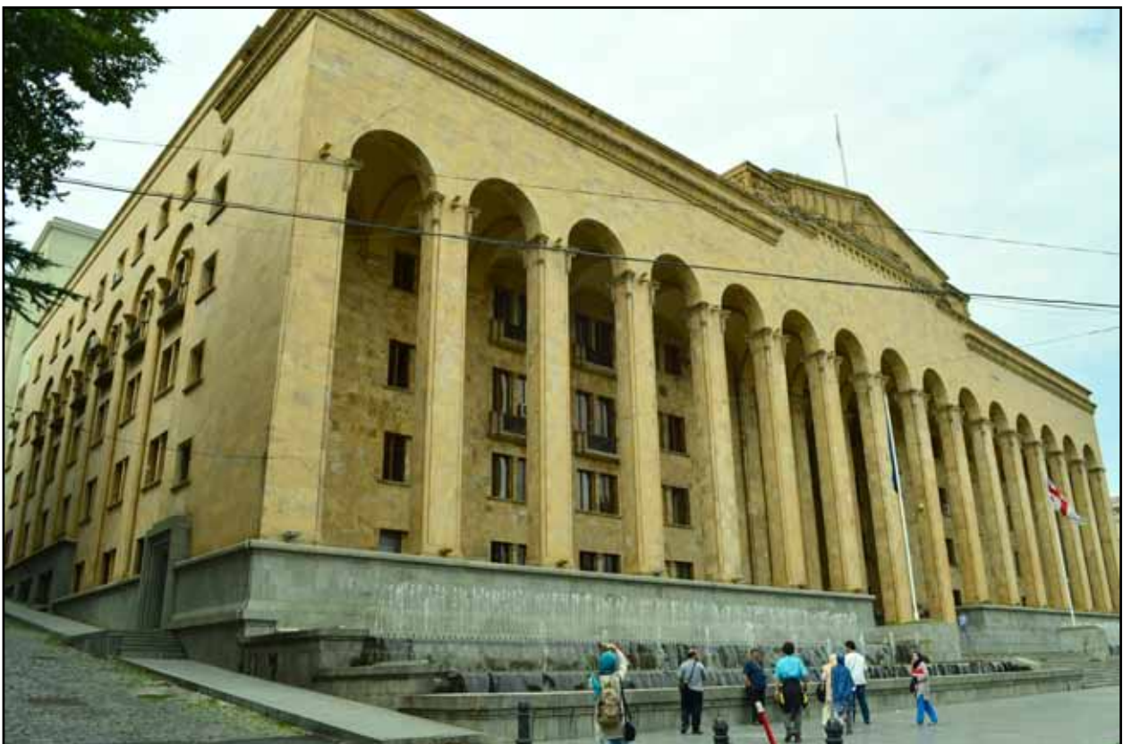
Fig.2. Provided space next to Rustaveli Avenue in Tbilisi indicating that these spaces have been created for the expression of authority of the state in the communist cities and social interaction had no place in it, Georgia. Photo: Zohre Shirazi, archive of NAZAR research center, 2013.