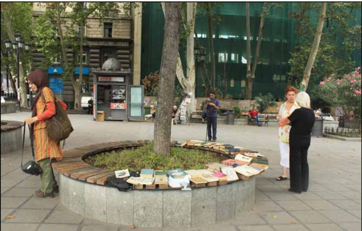
Fig.4. There is not any consideration for people activities in design of Tbilisi communal spaces, and people altered these spaces themselves through integration of additional elements, Georgia.