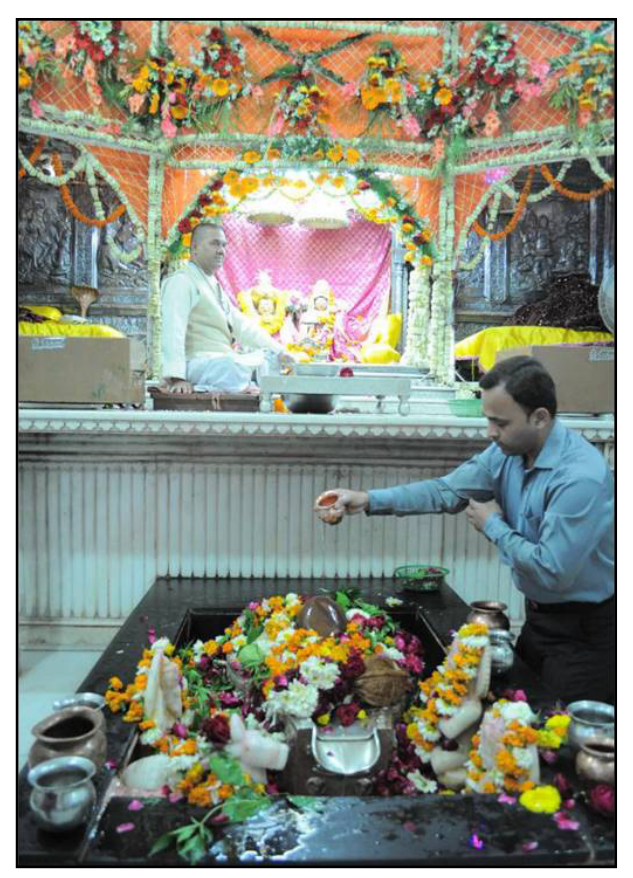
Fig. 5. Shiva temple altar. Delhi, India.

The color pattern of mosques in India will be analyzed in two division of old and new ones. The first division (old mosques) refers to both temples converted to mosques and early mosques. The second division consists of contemporary mosques which have been built with different patterns. Quwwat ul-Islam mosque in Delhi (Fig.9) and Jama Masjid in