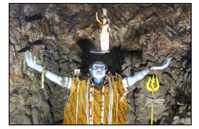
Fig.6. Shiva statue in blue and yellow. Shiva Temple , Delhi, India.