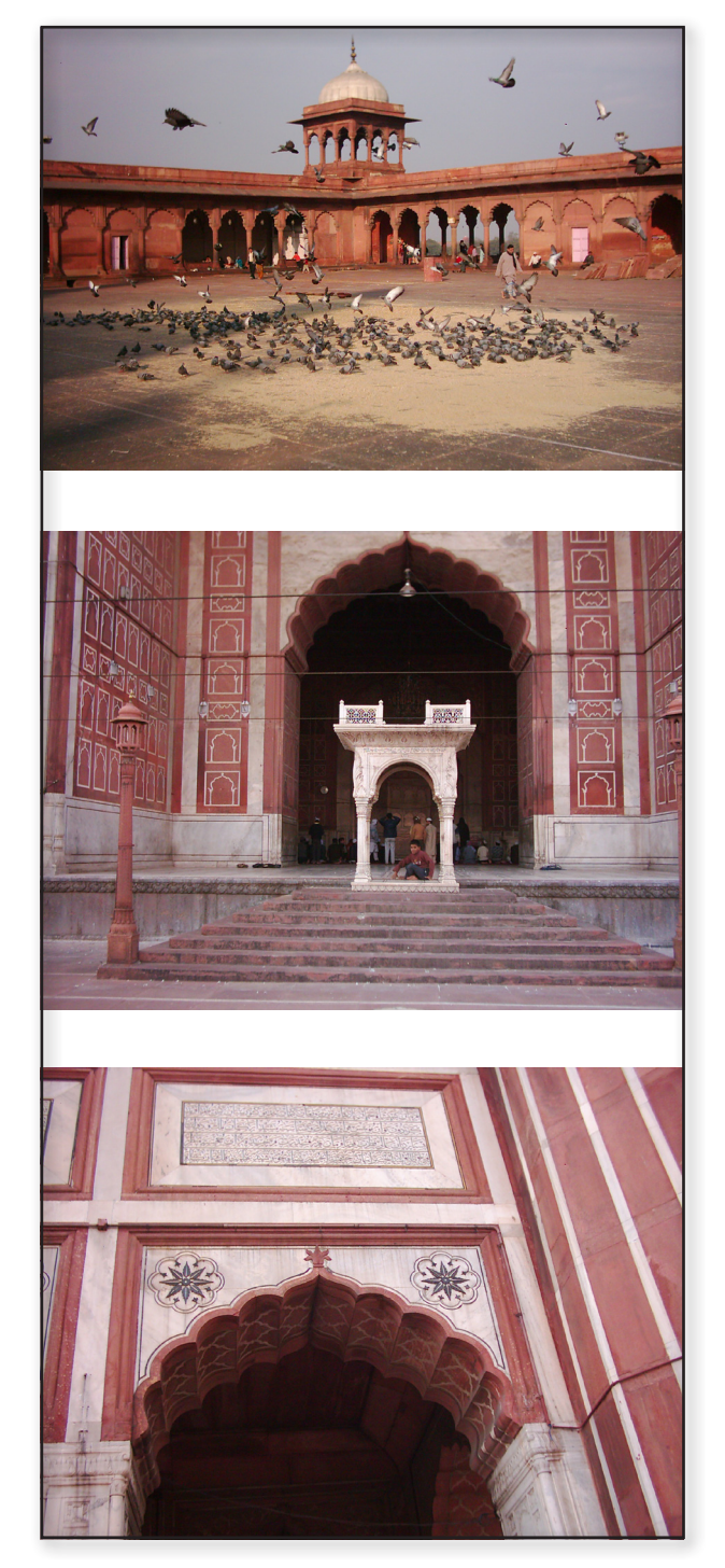
Fig.10. Two colors of red and white in Jama Masjid of Delhi , India.

Once Islam came to India, some of the great Hindu and Buddhist temples were converted into mosques. In the years to come, the architecture and decorative motives were influenced by Iranian and Arabic patterns; as a result, Indo-Iranian or Indo-Arabic architecture was formed. It seems that the colors