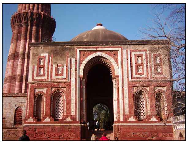
Fig.9.Two colors of red and white in Quwwat ul-islam mosque. Delhi, India. Photo: Seyyed Amir Mansouri, 2003.

because of their frequent applications during long time. The color pattern in the second group (contemporary mosques), is related to next eras and is based on two colors. Usually one of these colors is white and the second one may be green or pink. The main difference between these mosques and the first division, is painting (color coating) on the original material. This method is applied because of new materials and to make construction easier. As a local mosque, a small mosque in the Qutub Minar complex near Quwwat ul-Islam can be mentioned. The main color in this mosque is pink with white trim. The simplicity and sincerity of this holy place in its yard and porch with green and pink color with trees, greenery, garden soil and a small pond in front of the porch, have created a pleasant and relaxing atmosphere (Fig. 11). Extensive relations with other countries have had influences on the patterns of architecture and decoration including color pattern. Colors are sometimes derived from the architecture of Islamic countries, sometimes are influenced by Hindu temples, and sometimes are a combination of the two. The combination of green and white, like Arabic mosques, in a mosque in the urban fabric of Ahmedabad (Fig.12), and the combination of white, green and blue in a Hosseinie in Lucknow are seen (Fig. 13).