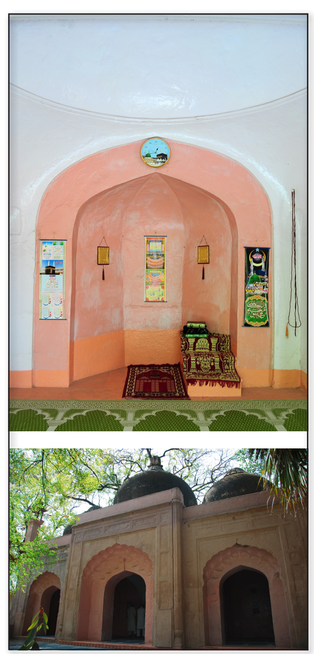
Fig.11. Pink , white and green in a mosque near Qutub Minar, Delhi. India. Photo: Zahra Askarzadeh, 2012.

For example, the Jama Masjid in Delhi and many other public buildings are in red and pink. Some sources have stated that it was the Akbar Shah's favorite color, and buildings with red and pink facades have been built in his time. The light blue color, which can be seen in the mosques as a faintly cover, may be inspired from Hindu temples as the color of Shiva. For mosques in other countries, blue was not common.<sup>1</sup> For green and white, two different origins may be considered: First, it may be derived from Buddhist and Hindu paintings that examples of them can be seen in the Ellora and Ajanta caves. Second, it may be influenced from Arabic mosques. According to Hinduism, white means having no color. Therefore, white is the color of the dresses of widows and hermits, and also the color of peace and purity. In Islam, green may be a symbol of nature. It has been repeated 10 times in Quran. White has been repeated 12 times in Quran. Since white has been considered as a sign for purity, immaculacy and absolute light, it has been important in Islam and ethics before Islam. Indian Muslims respect green and white probably because the prophet of Islam (peace be upon him) was interested on them.