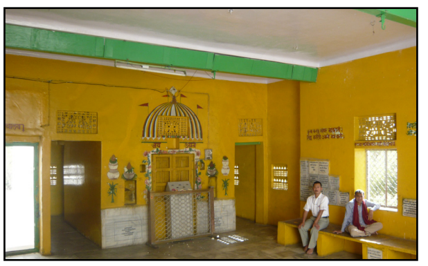
Fig.4. A cube shrine in yellow. Pushkar, India.