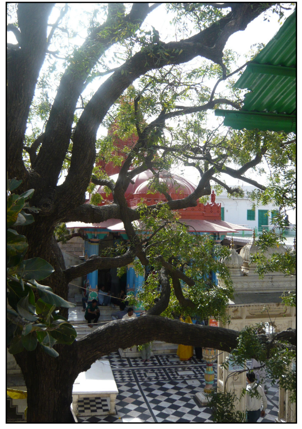
Fig.3. Yard of a Brahma temple checkered in black and white. Pushkar, India.

Jagdish Temple in Udaipur, which is related to Lord Vishnu, belongs to the 17th century. All external and internal spaces of the temple, including walls, floor and ceiling, are in white (Fig.7). Only the altar of the temple is in black (with yellow and golden ornaments and fabrics). Just like the Shiva temple in Delhi, the two colors of black and white have been used. It seems that aside from simple access to white stone in the nature, usage of white color in the exterior and interior of the temples is due to its concept: Purity and peace. The blackness of the altar, where gods are