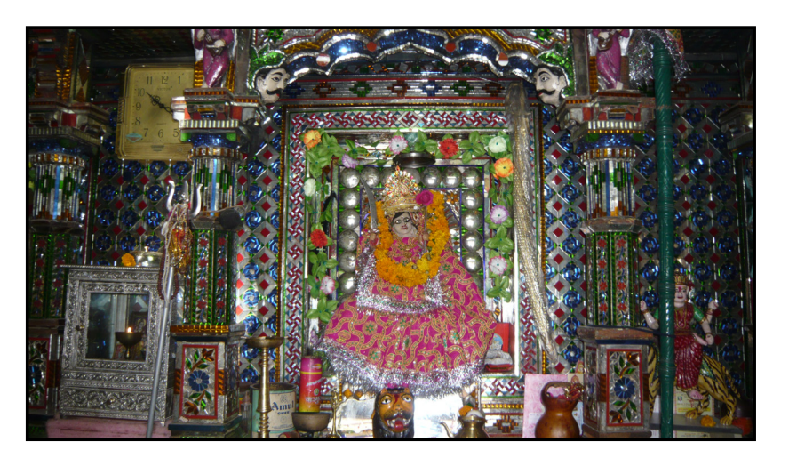
Fig.14. Mirrors in Imambaras like decorating mosques and Islamic shrines, India. Photo: Shohreh Javadi, 2012.