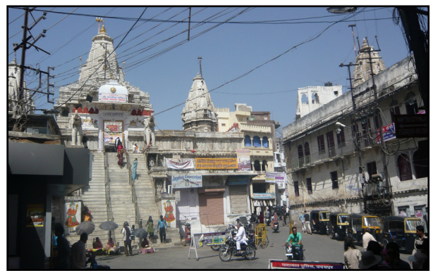
Fig.7. Jagdish temple facade, Udaipur, India. Photo: Shohreh Javadi, 2012.

Fig.8. Vishnu statue in the temple Jagdish. Photo: Shervin Goudarzian, 2012.