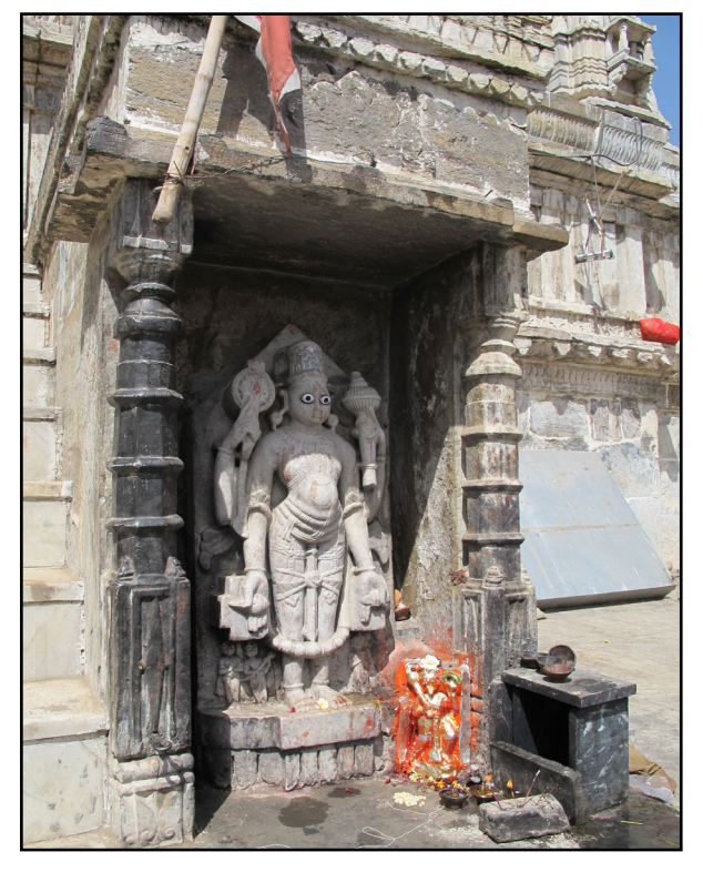
Fig.8. Vishnu statue in the temple Jagdish.

Ajmer are from the first group and have seemingly been converted from the Hindu temples. The basic colors of these mosques are gray and red, made from local soil. In the first group, Jama Masjid of Delhi, which has been built as a mosque from the first, is mainly in red and white, from vernacular and natural materials (Fig.10). The red color, which is sacred and important among Hindus, has been used in temples, mosques, palaces and forts. For example, a combination of red and white can be seen in the Red Forts of Delhi, Agra and Jaipur, the building of Safdarjung in Delhi and etc. Red and white had had natural origin; however, they became sacred colors