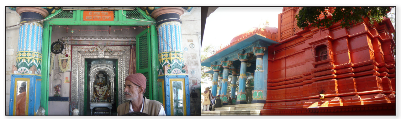
Fig.2. A Brahma temple and its allegory. Pushkar, India.