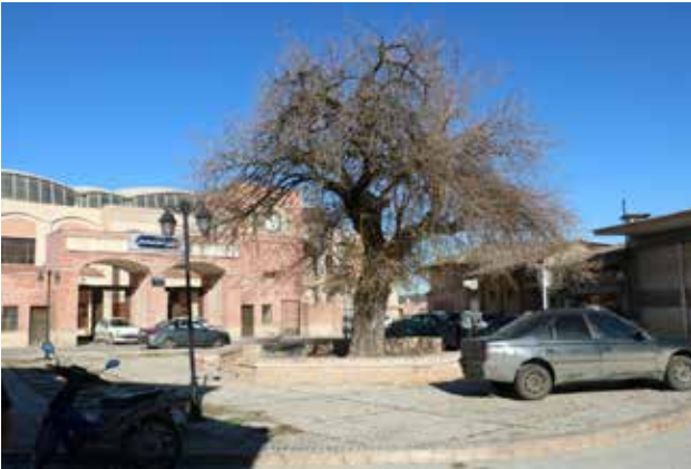
Fig. 3. Large-scale and non-service use of Mosalla in the center of Sabzeh Mashhad square, Photo: Ghazal Nickzad, 2019.