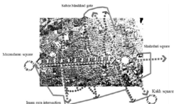
Fig. 4. Placement of new uses along the Piercing streets of the Pahlavi period

about 200 hectares, is the oldest historical district registered in the list of national monuments ( https://www.tasnimnews.com/fa/ ). The set of measures taken to modernize the historic district of Gorgan and its collective spaces has remained only in the area of hardening measures such as flooring and wall construction, and in the field of management, the implementation of sidewalks of the historic district has been limited to superficial measures due to lack of proper infrastructure.