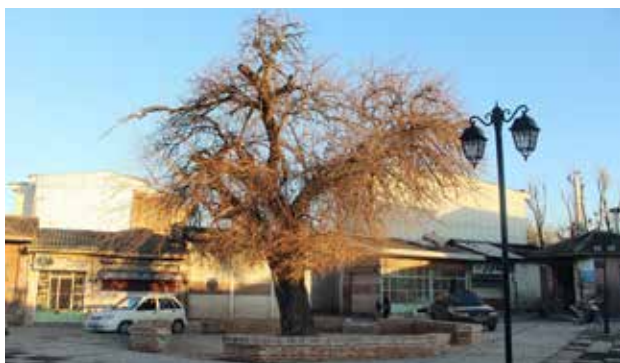
Fig. 6. Purely physical measures and landscaping in the renovation plan of Sabzeh Mashhad neighborhood, Photo: Hedieh Boroumand, 2019.