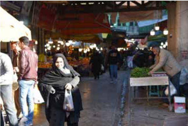
Fig. 2. Continuation of social life in the historical market of Nalbandan, Gorgan, Photo: Seyyede Yeganeh Nabaei, 2019.

provide a variety of uses and facilities as a way for all segments of society to be present (Amin, 2008). The mixed uses and diversity of activities in the physical organization of urban spaces is the basis for the presence of individuals and by providing the possibility of continuous use of space and making it spectacular, it plays an important role in the prosperity of collective spaces (Jacobs, 2013, 35).