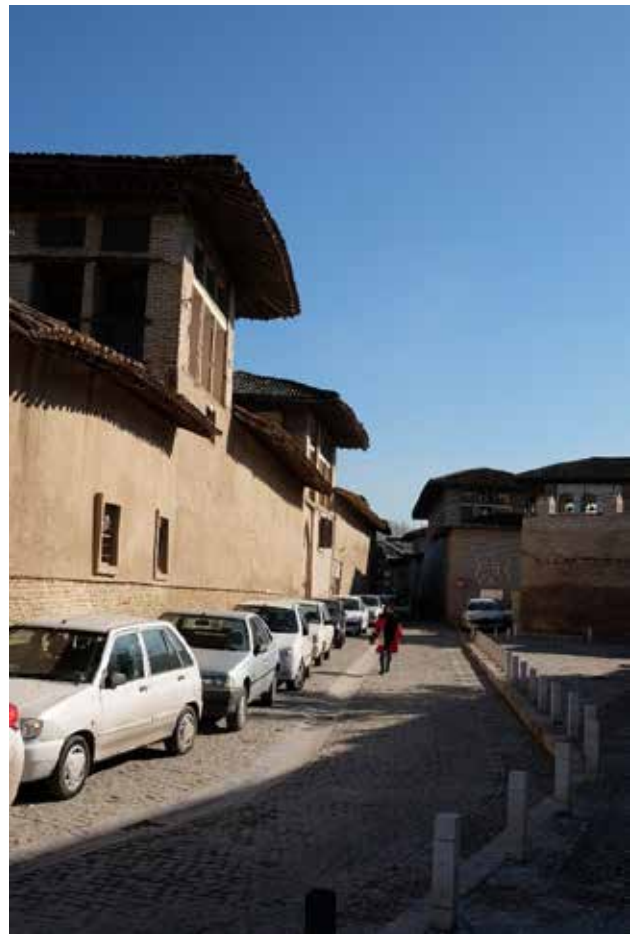
Fig. 5. Purely physical measures for pedestrian and social construction of Gorgan historical crossings.

Symbolic agreement in showing the general and social aspects of life is one of the characteristics of collective spaces (Francis, Giles-corti, Wood, & Knuiman, 2012). Successful public spaces increase the opportunities for participation in public activities. In this case, collective spaces will be a container of common meanings and beliefs (Carr, Francis, Rilvin, & Stone, 2011, 344). As mentioned above, Gorgan, like other historic cities in Iran, is based on a neighborhood system. Takaya, as one of the main elements of the neighborhood center, are identifying and unifying factor to the surrounding uses and the stability of the historic district of this city (Nazif, 1390, 2). The social spaces of the city are the place of continuous production of symbols and places that give the culture of existence, framework