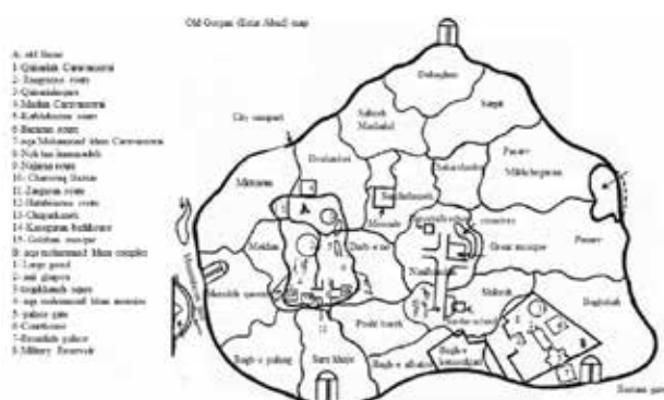
Fig. 7. Gorgan city settlement during the Qajar period. Source: Ma'tuofi, 1996, 327.

Today, the semantic role of neighborhood centers as collective spaces in historic Gorgan district is seen as a memory of collective space that is used temporarily.