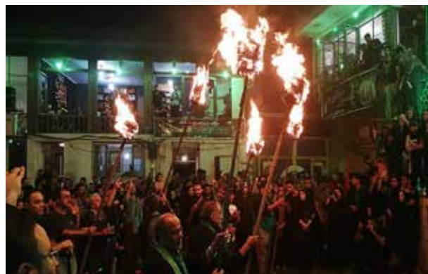
Fig. 8. Forming social and public space interactions in Gorgan's historical centers, photo from: https://www.nabro.ir/ .

Collective spaces in the historic district of Gorgan have historically existed in the form of markets and neighborhood centers. Today, they have changed in the long run due to macro-level management measures such as street construction and the lack of facilities to meet the daily needs of residents. However, among the components affecting the success of collective spaces, semantic and functional characteristics have a more lasting role than physical characteristics, respectively, and are less affected by external actions and developments. Today, in the historic district of Gorgan, with the exception of special cases, there is no collective space, and urban spaces, in the most optimistic case, have only a public aspect. Only the footprints of the city's former social life can be seen in the city's central bazaar, which continues to be active and socially influential due to its historical role and functional and service aspects, and neighborhood centers, thanks to their previous role, are shaded and reminiscent of collective spaces which are active during certain time periods such as rituals and mourning (Table1).