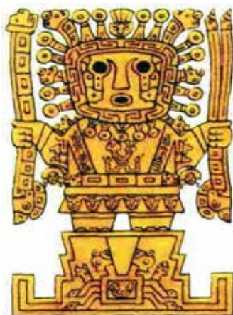
Fig. 12. B. Viracocha, the solar deity of the Inca with lightning in his hand and solar crown on his head and rainy tear.