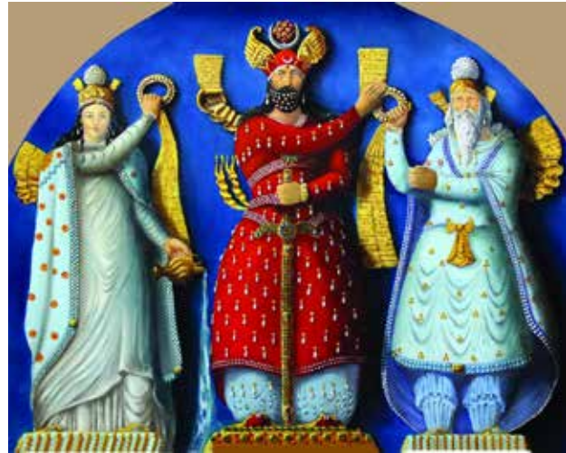
Fig. 14. Appointment of Ardashir II to the kingdom. From Left to Right: Mitra, Shapur II, Ahuramazda. Below: Julian, the Roman Emperor, Taq Bostan ("Arch of the Garden").

In Europe, ceremonies such as the spinning of ignited wheels on the occasion of the solar revolution and other similar ceremonies are the magical reconstruction of the solar forces. By sacrificing captives for the