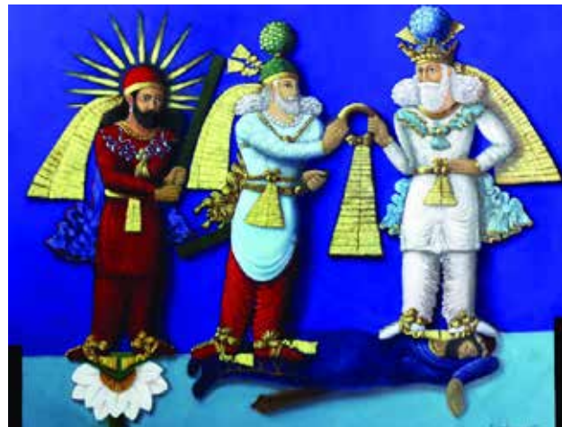
Fig. 15. The coronation of Ardashir II of Ahura Mazda in the presence of Mitra, Bostan Arch.

sun, the Mexicans secured its permanence because they believed that they would guarantee the renewal of the finished energy of the constellation. We can observe these solar heroes with African shepherds, Turks, Mongols, and Samson Jews, and among Indo-European nations (ibid, 153); (Fig. 16).