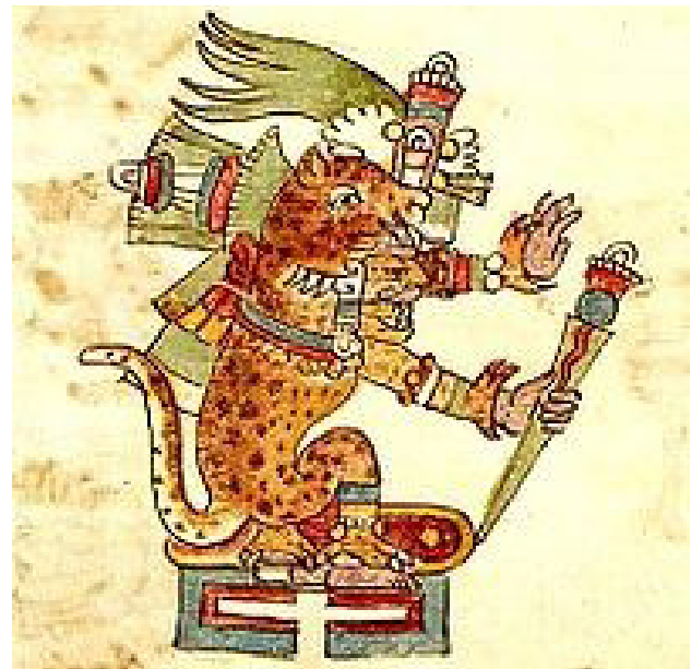
Fig. 1. Tezcatlipoca, the Mexican deity, in a jaguar form about the Shamanic 2 ceremony.

The sacred and mythical mountain of Egypt called Benben was the center of the world, which later became a sacred stone in the sun of Heliopolis and the symbol of the original holy mountain, and this is the first place of sunlight. Egyptian pyramids as a temple and a tomb were regarded as a symbol of the Benben stone (Hart,