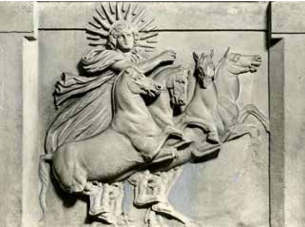
Fig. 8. Mitra on the chariot of four horses.