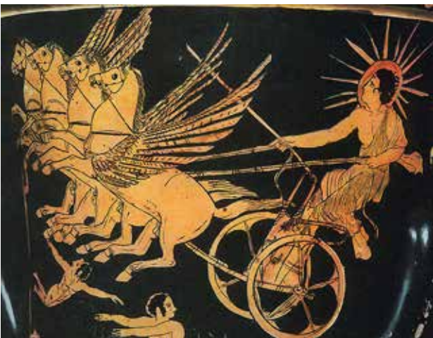
Fig. 9. Helios on the chariot drawn by four horses.