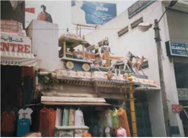
Fig. 7. Entrance to the temple in southern India, Mitra with a 4-horse chariot. Photo: Fereydoun Avarzamani, 2001.