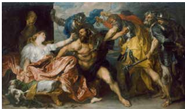
Fig.16. Samson & Deliale, Anthony Van Dick

the east and west of the world since ancient times, and the rituals related to the worship of this great god from the past to the present are performed in various forms in primitive and modern societies today. The sun, the symbol of divine light, has always been present in poetry and literature, art, and culture of the peoples of the world, and people have made a lot of sacrifices to God to preserve this vital force. The worship of the sun, which is accompanied by the rising and setting of this star and its radiance at noon, midday, and sunset, is found among Muslims, Buddhists, Hindus, and other religious denominations.