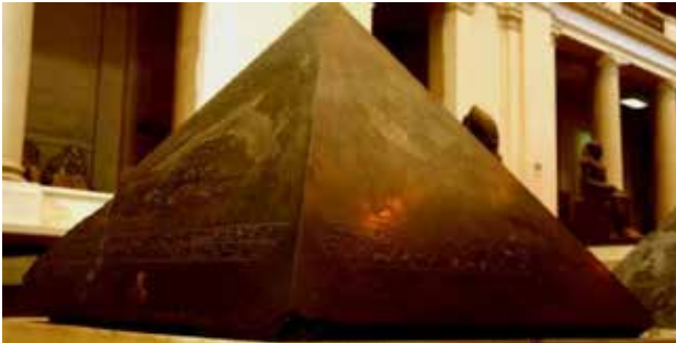
Fig. 2. The Benben stone is the holy stone he tip of the pyramid of Pharaoh in the temple of Phoenix.