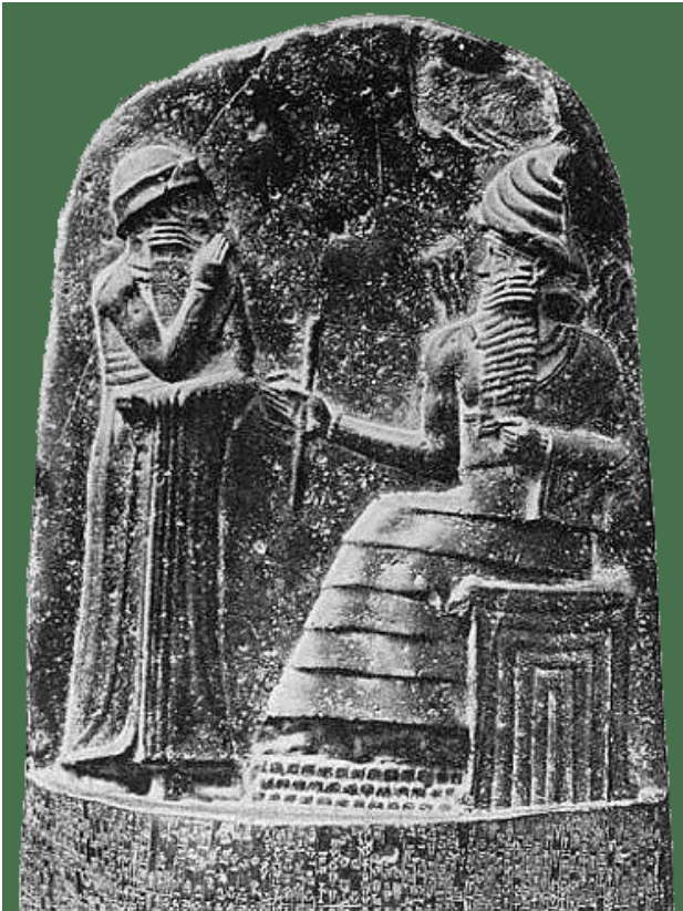
Fig. 13. Shams, the solar deity, Mesopotamia.

solar deities have been formed and manifested in every land arising from indigenous beliefs. Sometimes there are similarities between this world of myths, some of which have been transferred from one ethnic group to another.