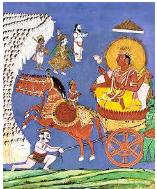
Fig. 6. Surya on the chariot.

Aztec, was depicted as an eagle in the form of Huito Yapocheitli, carrying a snake full of night stars in his beak (Fig. 12).