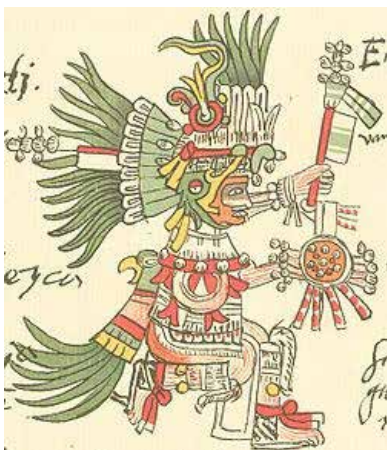
Fig. 12. A. Aztec, the solar deity, the sun of eagle (or Hummingbird) Huitzilopochtli, a design in Telleriano-Remensis documentation.

Among the tribes and nations of the world, they have had a high position since the most ancient times. The