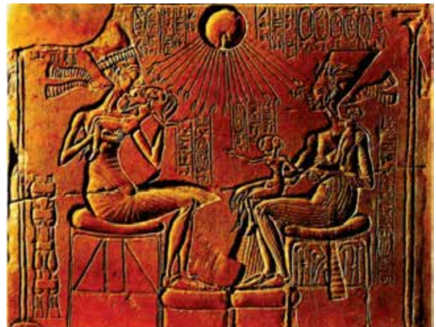
Fig. 5. Amenhotep IV & Atun in the sun form.

In the pyramid of the Gods, the Great solar deity,