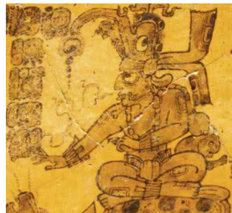
Fig. 12. C. Kinich Ahau the solar deity in Mayan mythology.