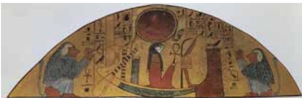
Fig.3. Rae, the solar deity, in the boat with two apes- the ceremony of sunrise.