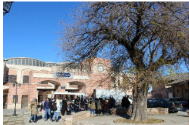
Fig. 2. Adjacency of a 200-year-old mulberry tree to Gorgan's Musalla

During the Qajar era, Iran was divided into 4 provinces and 12 counties and Astarabad was one of its counties and divided into 5, 7, or 8 blocks: Anzan, Sadan Rostaq, Astarabad, Shahakvin and Savar, Dahat Malek, Katul, Fenderesk and Ramian and Koohsar. Each of these blocks was governed by a deputy governor assigned by the governor of Astarabad. Astarabad was one of those counties which were the base of the Qajar dynasty and became religiously important with the name of Dar al-Mu'minin. In the early twentieth century, Gorgan had a great number of mosques, religious tombs, religious schools, and tekyehs. The importance of Astarabad in terms of politics and religion in this period caused the Georgian language to become disappeared and be replaced by the Persian language ( https://shoaresal.ir/fa/news ). In the early Pahlavi era, the structure of the city was in