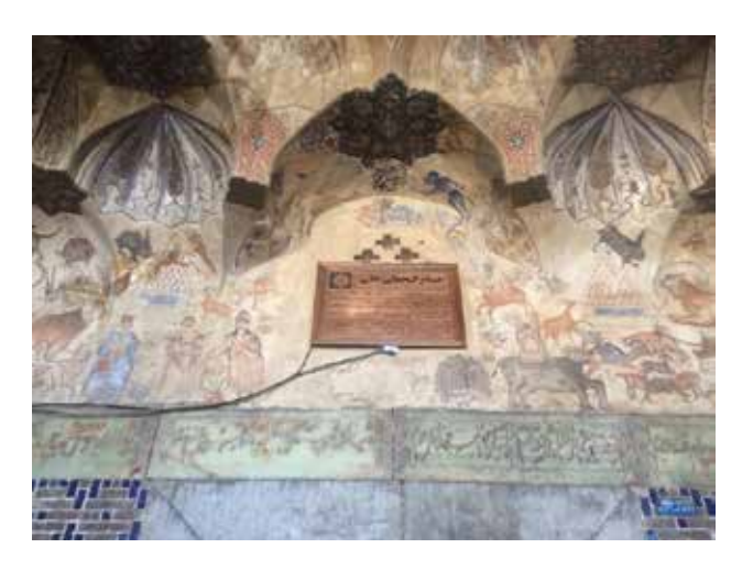
Fig.4. Paintings on the facade – Ganjali-Khan bath.

Understanding the motifs and the art used in this bath as a case study, it can be understood that the mentioned trinary motifs in the forms of animal, plant and human motifs, at three levels, represent the meaning which people and artists get about their surroundings. These three levels include: 1. opinions, beliefs and narrations: embodied in the illustrations of ancient stories, superstitious beliefs and religious icons. 2. Social events and happenings: It mainly includes ceremonies where the framework of the bath has been welcomed and is related to weddings, Henna, celebrations and stomps ceremonies, or has dealt with the social class of the groups using the bath. And 3) Kerman exclusive scenery: It mentions plant and animal motifs that have been most visible and represented in Kerman, although it has taken on a new form in relation to European artworks.