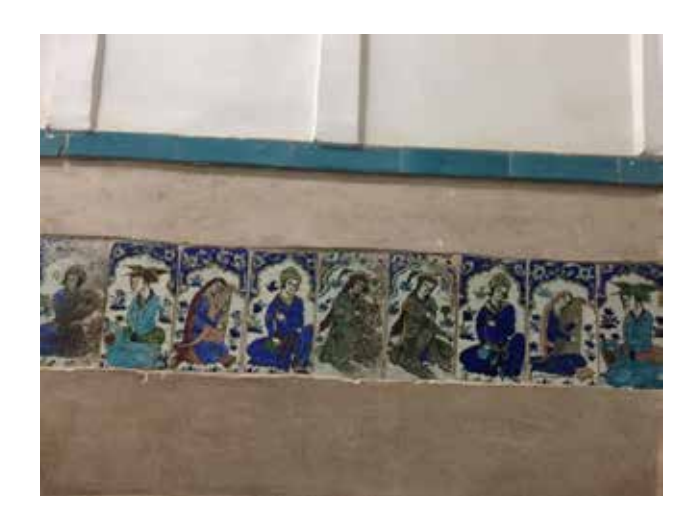
Fig. 3. Human motifs of women parties, Ganjali-khan Bath.

that were dancing and stomping at the nights in the baths scared children. Dehkhoda says in the book titled "proverbs (Amsal va Hekam)": According to the popular opinion, the Fairy tales gather in baths, headwaters, groves, and forests in the darkness of the night (Rezaei & Bataghva 2003, 172). One of the first drawings to draw attention to this regard in Ganjali-khan bath is the façade paintings. Those paintings by drawing of goblins alongside the narratives of Khosrow and Shirin and Bahram Gore point to the depth of the superstitious beliefs among people alongside the stories and the presence of them in the bath, as a popular space (Fig. 4).