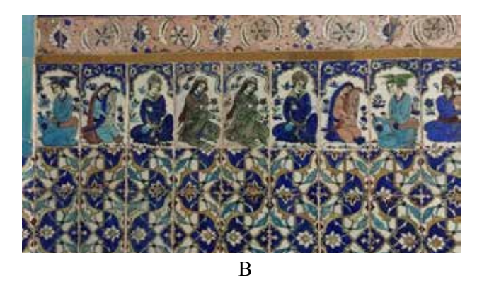
Fig. 1. A, B: Paintings and bathroom tools and their ritual function-Ganjali-Khan bath.