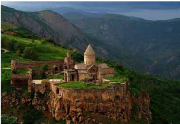
Fig. 1. Tatev Monastery in Armenia, which has been initially of Mithraism temples turning into church after Christianity. Many of Mithraism temples can be seen around Armenia, which have been desolated or become monasteries.

largely inspired by Persian emperor. Comparing Mitra in Iran and Armenia, it is concluded that the majority of Armenian mythology and public beliefs before Christianity were largely influenced by Iranian mythology such that ancient beliefs transformation is clearly seen in the new religion (Figs.1-7).