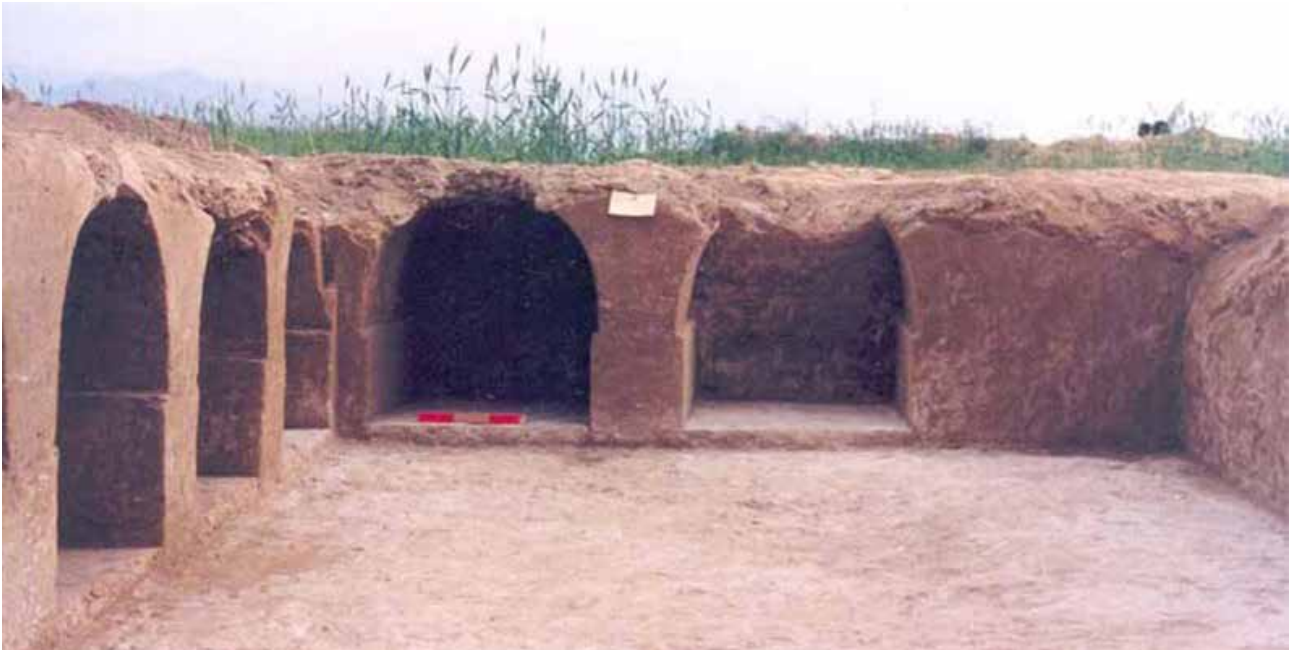
Fig. 6. Mithraism temple, Mohammad abad Borazjan, Iran.