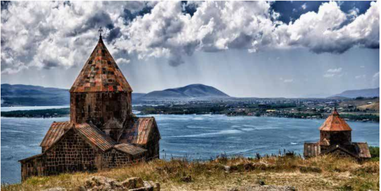
Fig. 4. Sevanakvank monastery in Armenia. Source: www.kojaro.com .