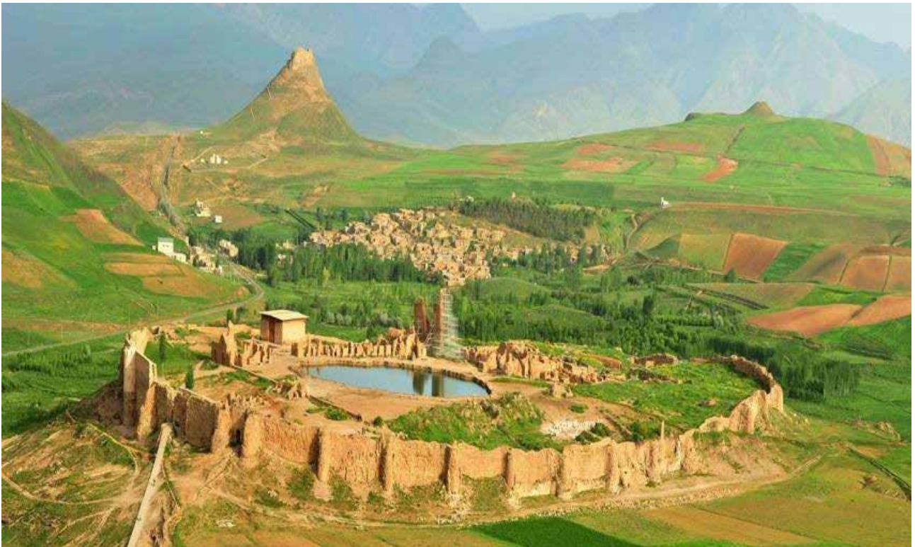
Fig. 5. Takht-e Soleymān, Mithraism temple in the age of Parthian; two sacred elements of mountain and spring can be seen.