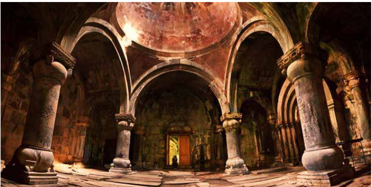
Fig. 3. Sanahin monastery complex interior in Armenia looks like Mithraism altars.