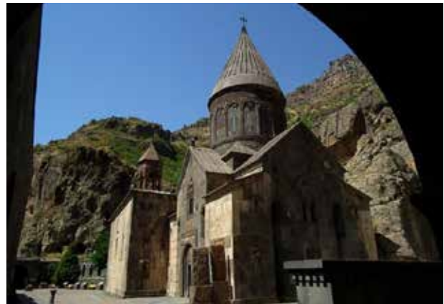
Fig. 2. Geghard Monastery in Armenia.