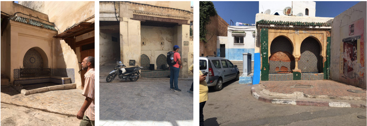
Fig. 9. The shade on the top of the fountain has made a difference in some neighborhood center. Fes, Fes, Rabat. Morocco. 2016.

pared to the other element, this area is elevated or its scale is different. In fact, the fountains are defined in the scale of the center of the neighborhood and are located on the wall. However, they differ from other elements and such difference can be seen in their decorations. In fact, the decoration of wall fountain has made it different from its context. The walls, tap water, basin, the top of the fountains, sometimes sunshade, are decorated. The wall fountains are located on the walls of the center of the neighborhood and different from the spring coming out of the ground. Due to the importance of water, the fountain water should not be wasted and its flow should be controlled (Fig. 9).