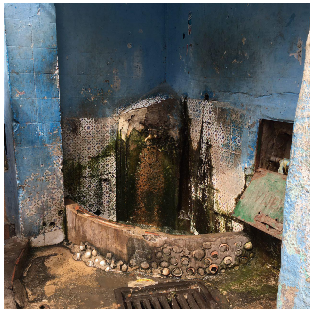
Fig. 8. Differences in the fountain wall using natural elements such as river rocks and sea oyster. Tangier, Tetouan, Tetouan. Morocco. 2016.