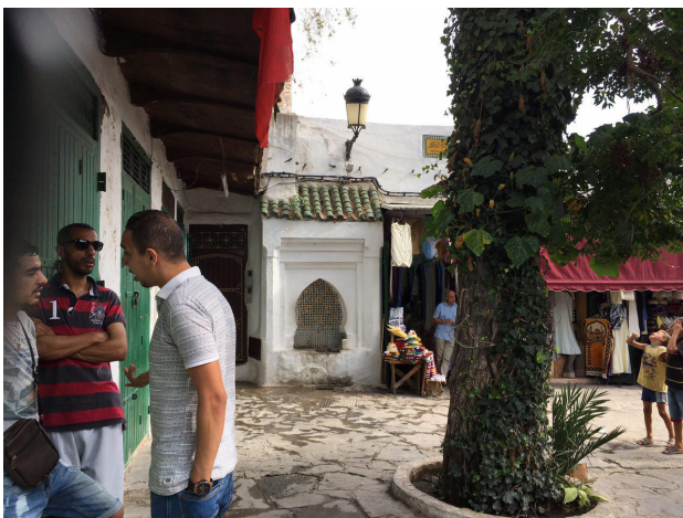
Fig. 7. Developing religious, social and cultural space next to the fountains in Moroccan cities of Medina. Tetouan. Photo: Fatemeh Al-sadat.Shojaei.Morocco. 2016.