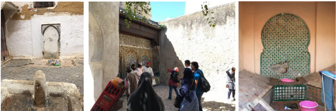
Fig. 4. The Fountain, the common element at all the milestones in the cities of Morocco. Fes, Meknes, Tangier. Photo: Fatemeh Al-sadat.Shojaei.Morocco. 2016.

The wall Fountains lying at Medina's centers are decorated .Tiles are used for decorating all or half of the wall fountains .Examining the economic condition of residents of the neighborhood shows that economy is tightly associated with the extent of decoration .Large tiles are most often seen in the Medina's centers including several shops or a mosque-like building .Most of the houses are located at the smaller centers where decorations of the fountains are limited to the tile designs (Fig. 5). What is important is that the audience can perceive the beauty ,difference ,and the uniqueness of the art ,and realize that the fountains have made the place more beautiful .The audience's culture can be different from the constructors of the foun-