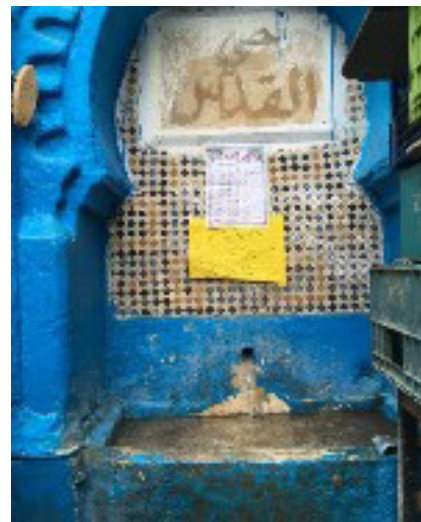
Fig. 3. Holy phrases and the name of God on the walls of the fountain. Tetouan, Morocco. 2016.

crossroads) helps the audience with the geographical position, and assures us that this is the place we are looking for (Cullen, 1961). In fact, the landmark space is different from the other places in terms of some features, and it is what the audience is looking for it. The landmark space can