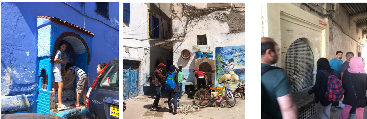
Fig. 5. Differentiating the walls of the fountains in Medinas from the context using colors . Chechaouen, Fes, Essaouira. Photo: Fatemeh Al-sadat.Shojaei.Morocco. 2016.