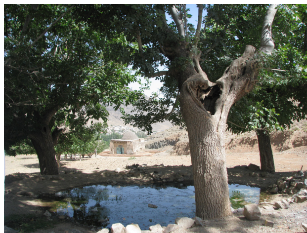
Fig. 1. The association of the spring, tree and Chartaghi, Neshalge Village, Isfahan. Iran. 2013.

The structures of the square or center of the neighborhoods in Iran are different from the ones in Greek and Rome. The fountain has been recognized as an important element in ancient Greek and Roman lands. The centers are also larger than the ones in the local centers of Iran. In fact, the centers serve as places where various