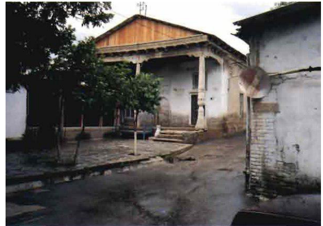
Fig. 2. The center of the neighborhood in Central Asia serves as the platform for social relations.

turn into the center of the neighborhood. However, all the neighborhood centers cannot serve as landmarks. Some elements are only available in the landmark space. In the cities of Morocco, the fountains are common elements that exist in all the center of the neighborhoods (Fig. 4).