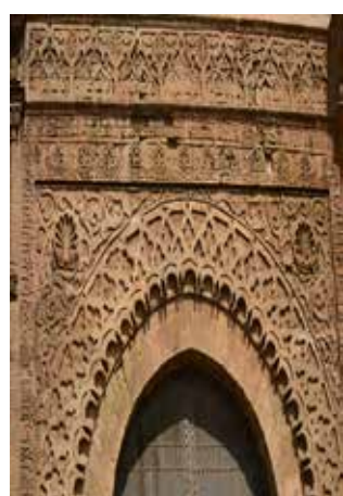
Fig. 12. The entrance of Rabat castle and the window of Bou Inania Madrasa. Meknes.

observe the religious limits. According to this approach, with any shift from foliage arabesque in Islamic art towards merely geometric motifs, colour loses its significance, and the motifs are usually used in monochromatic colours with natural colour of materials (khaki or white). But, given that in Morocco, these motifs are used as a visual representation, rather than a response to a design requirement, they usually adopt some