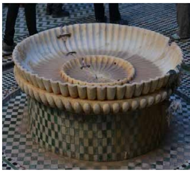
Fig.10. Bou anania School in Meknes.