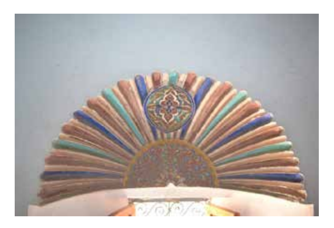
Fig. 11. Selfish design of Window arch, Ouarzazate. Photo: Mojgan Mokhtari, 2016.