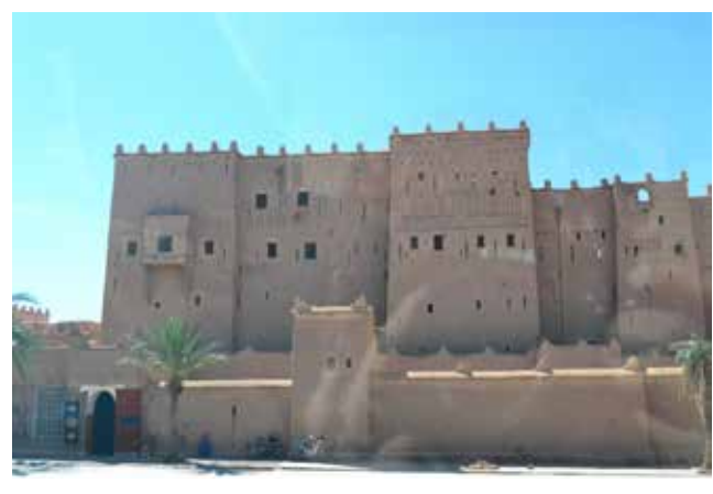
Fig. 5. Vertical seam on decorative arches of Berber's architecture, Qasba, Ouarzazate. Photo: Mojgan Mokhtari,2016.

With the evolution of the Moroccan arch. both in two-dimensional or three-dimensional applications, this vertical extension incorporates itself into the arches of the Islamic period in form of keystones. This extension, in many cases, is mostly referential rather than decorative and is an inherited design feature. Because, like in the Maulla-Idris Mausoleum below, removing the aforementioned extension does not cause any change in the composition of the decorations, the arc proportions, the distance between the arc and the horizontal margin above it. Insisting on maintaining this extension in this case or even in other cases is largely unnecessary. However, this motif is used to divide the fine-grained decorative texture over the arc, and whenever the division takes place more decisively, this vertical extension is incorporated into the texture much more effectively.