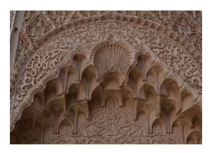
Fig.7. Bou anania School in Meknes. Photo: Mojgan Mokhtari,2016.

Islamic geometry motifs with barbarian colours The stucco motifs used in Islamic decoration are an attempt to develop abstract decorations and