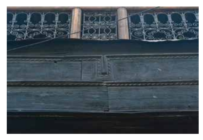
Fig. 2. Rope's Motif retrieved from the cord-like staging. Saras of Bazar in the city of Morocco.

The specific layout of this vertical element in the middle of the vault also gives rise to another hypothesis about the effects of the keystone, the most obvious of which can be found in