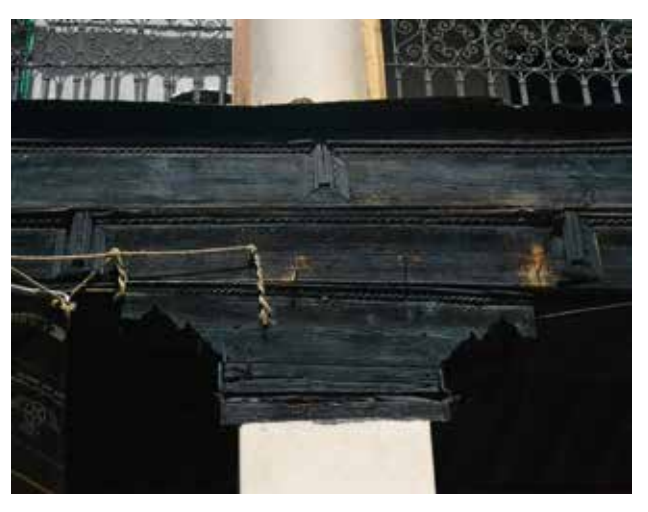
Fig. 1. folding in rope's motifs, Saras of Bazar in the city of Morocco. Photo: Mojgan Mokhtari, 2016.