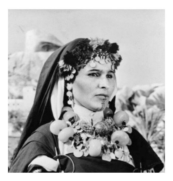
Fig.9. Shelfish decoration.