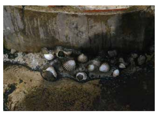
Fig.8. Shellfish Decoration, Fountain next to Tetouan Mosque. Photo: Mojgan Mokhtari,2016.