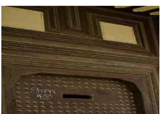
Fig. 3. Applications of rope's Motifs in different situations. Residential buildings in Tetouan. Photo: Mojgan Mokhtari, 2016.