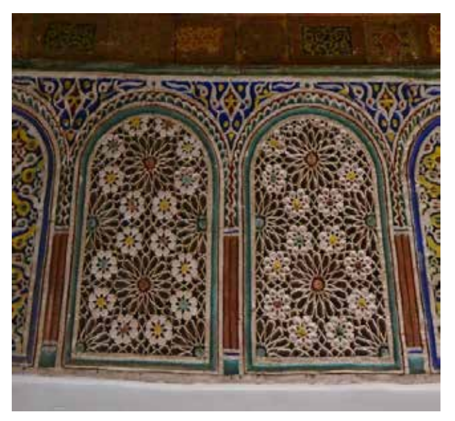
Fig.13. Kasbah Settlements, ourzazate. Photo: Mojgan Mokhtari,2016.