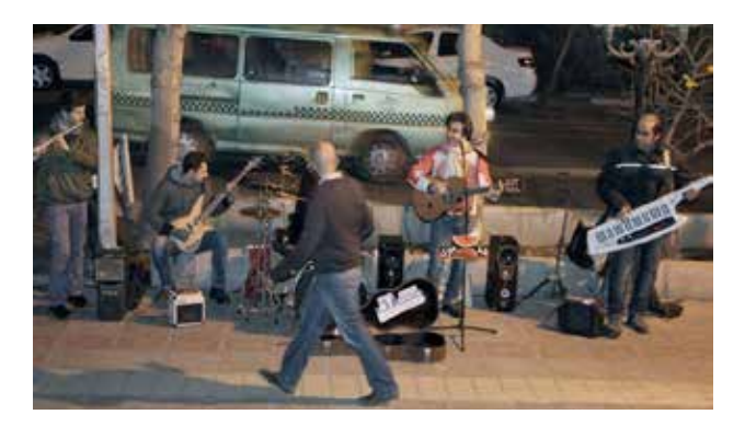
Fig.7. the position of street musician at Enqelab Pedestrian.

music and they believe that communication with people is the essence of street music. These individuals consider themselves as the advertisers of high quality music among people, so they feel responsible in front of people even though they are free. In this regard, these musicians not only try to introduce music art and its instruments but they also face challenges of producing high quality music which is also desirable for Iranian citizens. A little far in Mirdamad street near commercial centers, a young man is playing music. He feels satisfaction by making good sense for pedestrians and has the sense of profitability for society which serves his internal needs as a musician. This point shows that, in contrast to past, today street music is free from occasional celebrations and it is not only doing a service for a specific happening or any other aims except music. In fact, the art of music is performed as a principle currently and it has gained an existing value. That is what the young street musicians are trying to transfer to the audiences. They initially aim to present the essence of music free from any other happenings in the performance.