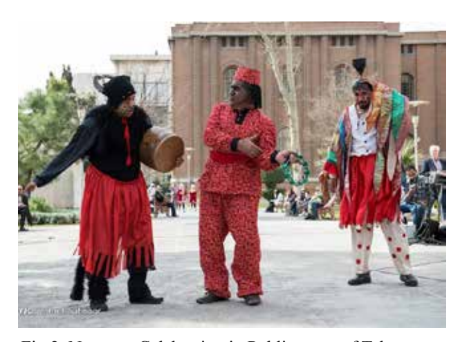
Fig.2. Nourouz Celebration in Public areas of Tehran, Source: Young Journalist club, 2015.