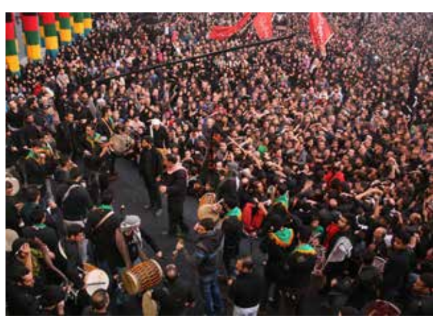
Fig.1. The celebration of Ashoura in Imam Hussein, Tehran.

According to the field observations street musicians can be divided in two general groups: the first one are who play music just for earning money despite their lack of any music skills. These ones are mostly around crowded public parts such as bus stations. They are usually from low class of society begging while playing music by their instruments. Regarding what has been told about street music history, these ones can be