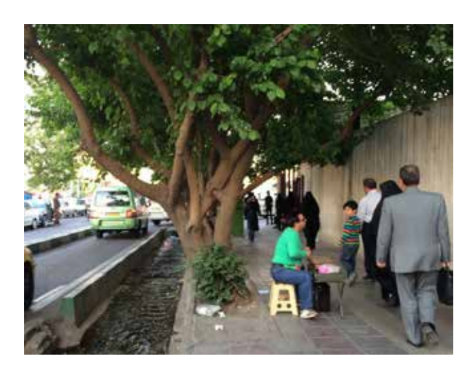
Fig.8.The position of street musician at Valiasr street pedestrian upper than Vanak Square.