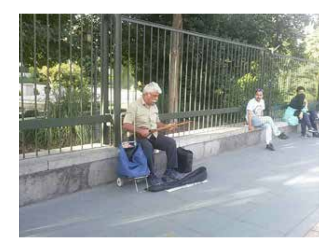
Fig.6. The position of street musician at Vanak pedestrian.