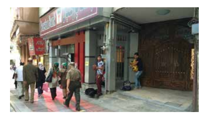
Fig.4.Street musicians in local style at Valiasr pedestrian, Tajrish.

As it was mentioned in street music history, in past one of the most important roles of musicians was transferring messages to citizens. In fact, this art in past like the contemporary one depended on location and the performances were for and among people, but the difference of previous and today performances is about the time of performance. In past, the performances concerned celebrations and some specific times such as tribal, religious and national memories. In fact, music was used less for introducing to people but for another aim. As it was mentioned in the history of music, it was firstly used for kings and their appreciation and then some other goals such as people's entertainment, transferring news and celebrating religious, cultural, historical memories. It is clear that all these led to earning money and gaining a position by musicians. In addition, daily happenings were a part of musicians' jobs