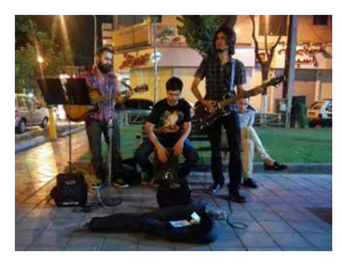
Fig.5.street musicians in modern style in Tehran. Photo: Parishehr Asl Falah, 2016.