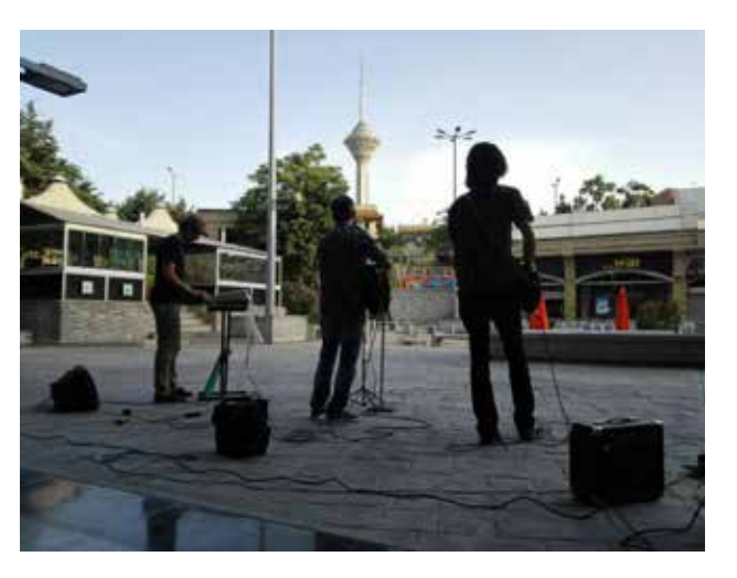
Fig. 10. The position of street musician at Golestan shopping center, Tehran.