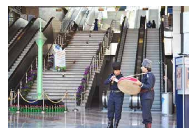
Fig.3. Norouz Celebration in front of Milad Tower.