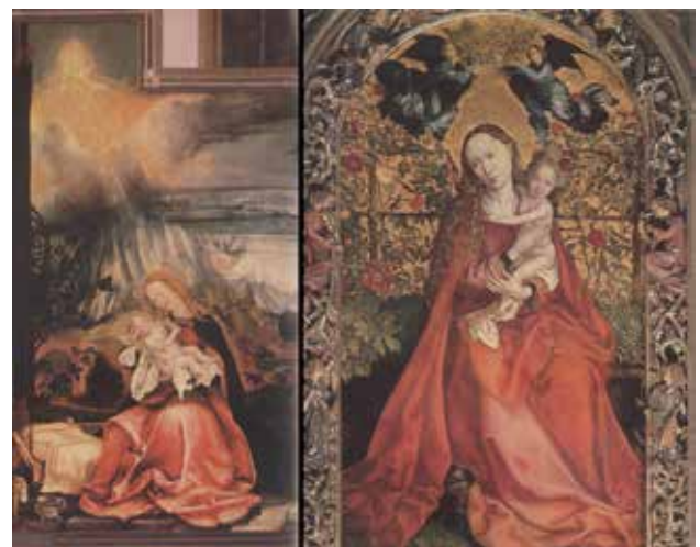
Fig. 2. Light prevails in Christian Art . Source : Heck, 2007: 94-98

Symbolic art explores the ideal perfection; in other words, it associates with the ideal perfection and tries to embody the infinite. To achieve this purpose, the artist utilizes symbolic expression to imply the infinite. At this point, the artistic expression is a mean to guide the audience to a spiritual understanding of the transcendent and metaphysical truth. Therefore, it avoids mastery, precision and refined forms of expressions seen