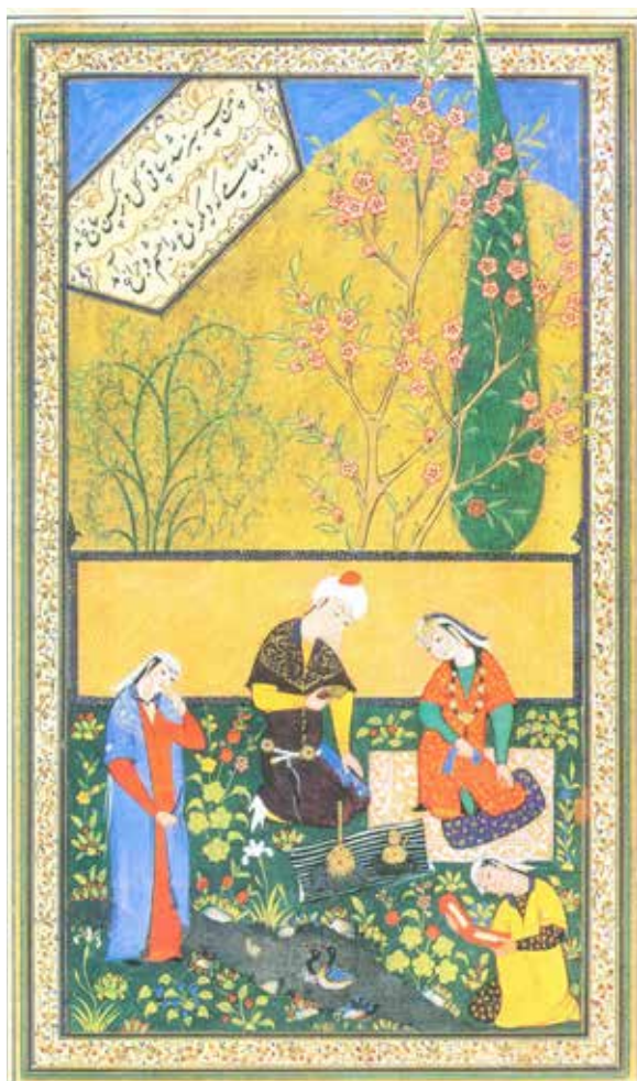
B. Persian miniatures