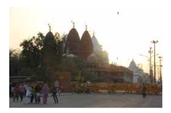
Fig. 1. Religious spaces of different religions get together Chandni Chowk.

religious buildings in Delhi symptoms affect morale as social capital, create focal point in the city. Urban spaces around Chandi Chowk have played a critical role in the center of Old Delhi for years. It leads to the creation of public space base on interacting Elements. Everyone has the potential to participate in this space, and nobody has an advantage compared to others in this space.