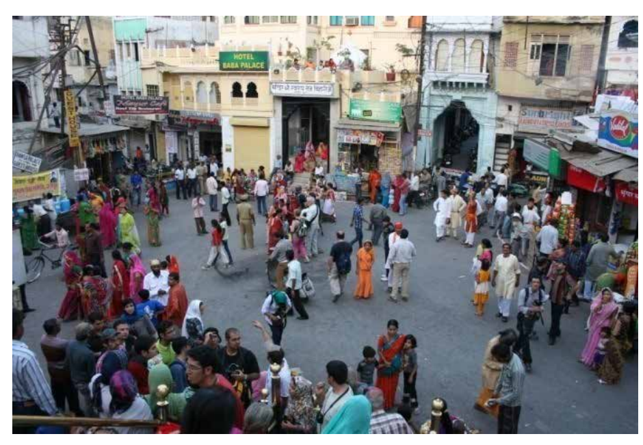
Fig. 3. The formation of public place in the context of landmark.

The proximity of the unplanned buildings set around a religious sign, the effect of communicative action that makes understanding the historical past and present by providing communication between cultures and groups, which contributes to social cohesion. This focal point product combines the ideals of cultural and socio-political body, and in a system with special rules to maximize the options offered to the public through a democratic environment provided for users (Ibid: 4) and created a strong public domain is.