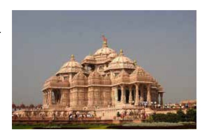
Fig. 2. AKshardam temple is separated from the surrounding tissue. Photo: Leila Soltani, Archive of Nazar research center, 2012.

The temple massive scale as a component and objective perspective Delhi artifact due to the physical characteristics of its index, only