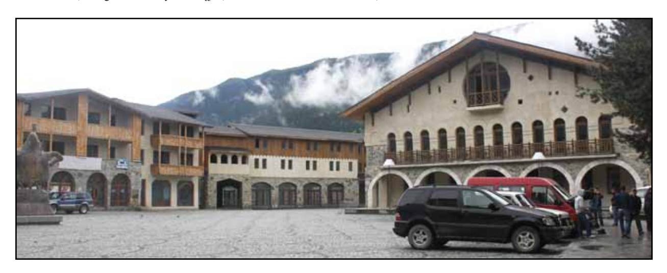
Fig.9. Downtown Mestia is solely a superficial imitation of western models and the appropriate actions to create interaction between the citizens are not considered, Georgia. Photo: Reyhane Hojjati, archive of NAZAR research center, 2013.