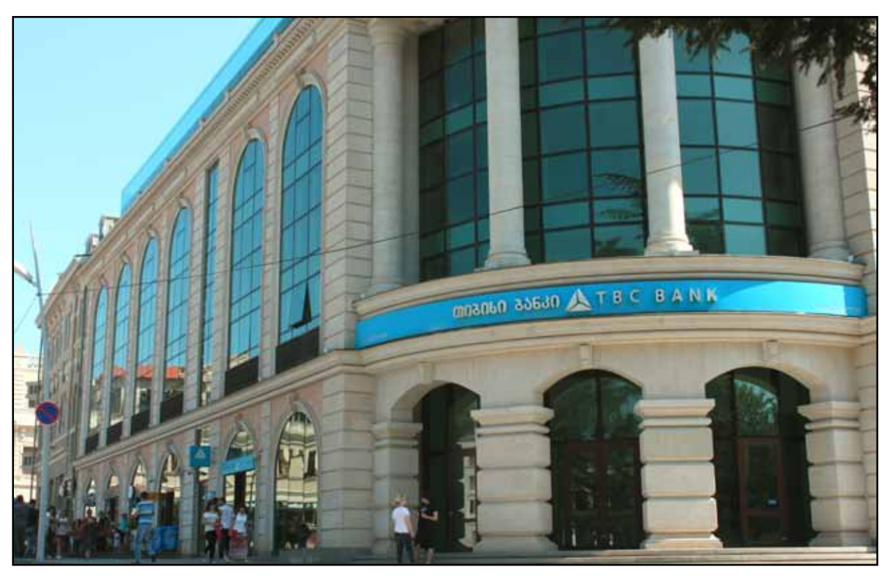
Fig. 3. Application of western classical architecture and imitative furniture in Kutaisi downtown in Georgia represents an approach which seeks to join the world and European system, Georgia. Photo: Reyhane Hojjati, archive of NAZAR research center, 2013.