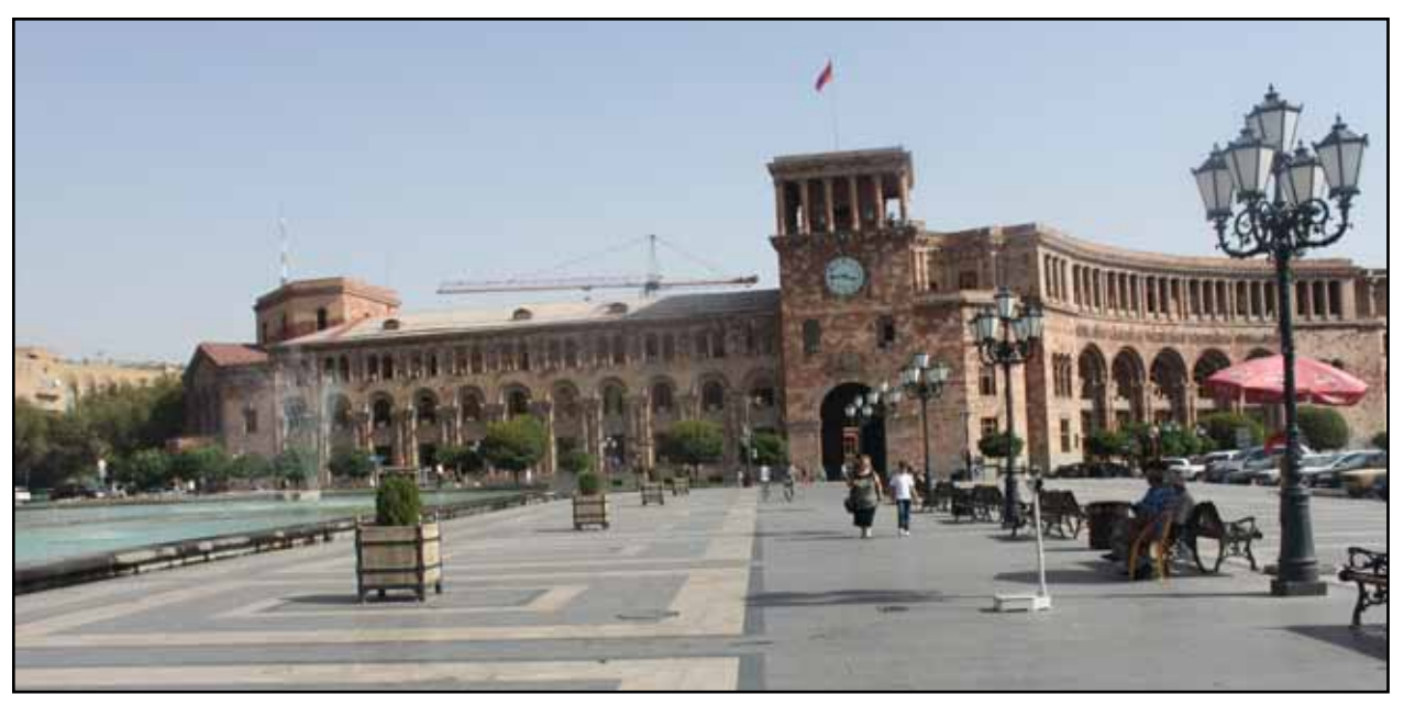
Figs.6 & 7. The poorly designed communal space of Republic square of Yerevan is causes the emptiness of space and lake of passerby during the day, Armenia.

ing the Soviet Union regimen. But in Mestia - one of the touristy cities in Georgia- which maintained its traditional context during the Soviet regime, there are a similar approach to management of city landscape and its European model. In this small town, the central area of the city which has played the role of the communal space in the past was lost its traditional features in the overall structure and function due to recent restoration. Large buildings with wide entrance and business applications in which most of them are empty and without prosperity and the use of furniture with European models are all product of Western-centric approach to