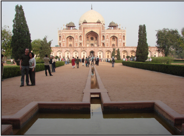
Fig.3a. The width of the axis in Indian garden shows off in thin space of the garden. Humayun tomb-garden, Delhi. Photo: Mehrdad Soltani, 2012.