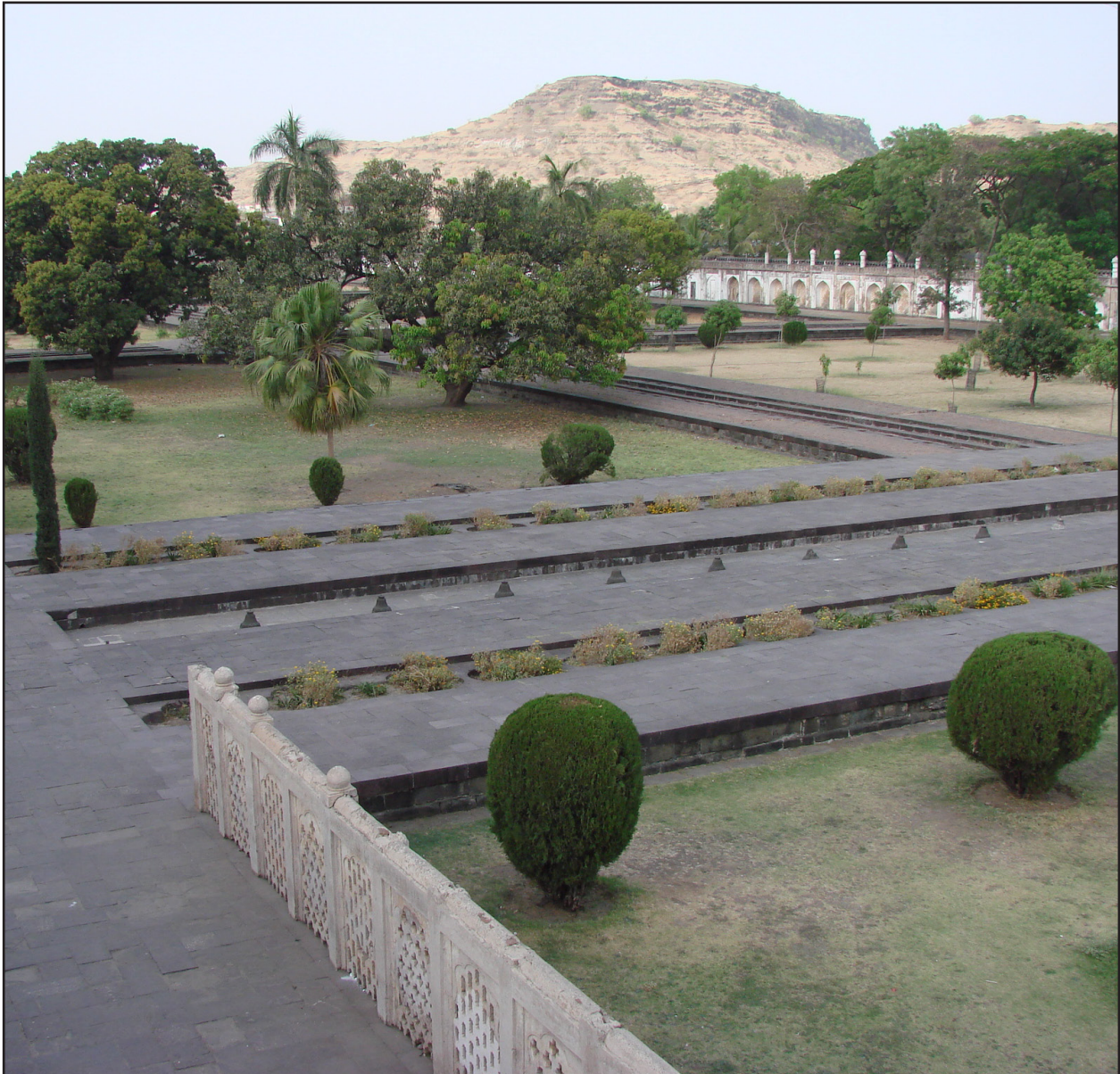
Fig.6. Landscape of geometric divisions of the garden on the top of high platform in Indian garden. Bibi-ka tomb-garden, Aurangabad. Photo: Mehrdad Soltani, 2012.

Also, the existence of high trees and dense vegetation reduces the appearance of the hard landscape of the garden.