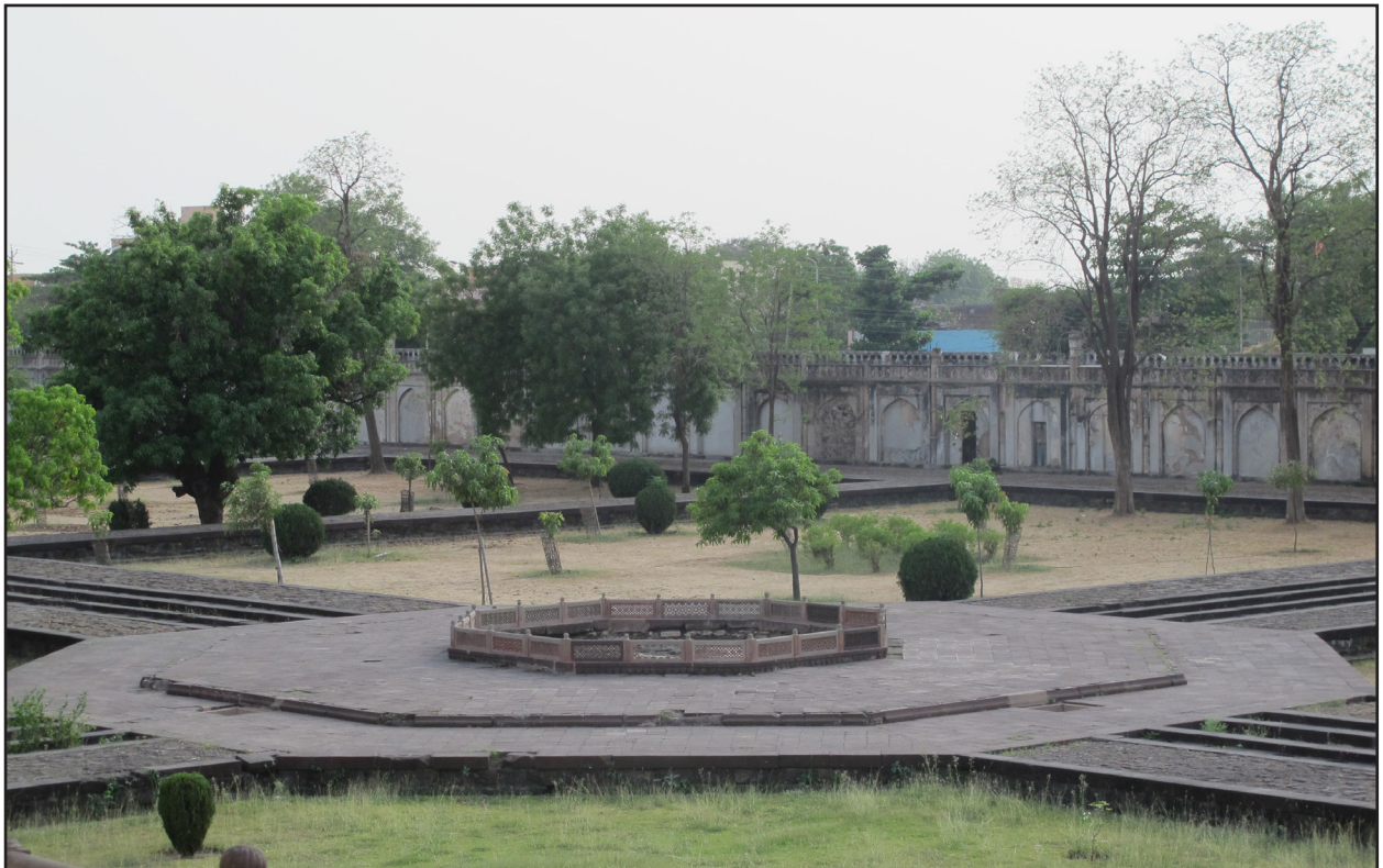
Fig.2. The wide platform at the intersection of the minor axes of Indian gardens. Bibi-ka tomb-garden, Aurangabad. Photo: Shervin Goodarzian, 2012.