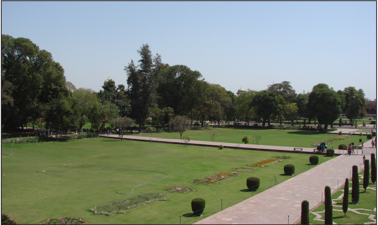
Fig.7. The height difference between the floor building surfaces and plots of Indian gardens. Taj Mahal tomb-garden, Agra. Photo: Mehrdad Soltani, 2012.