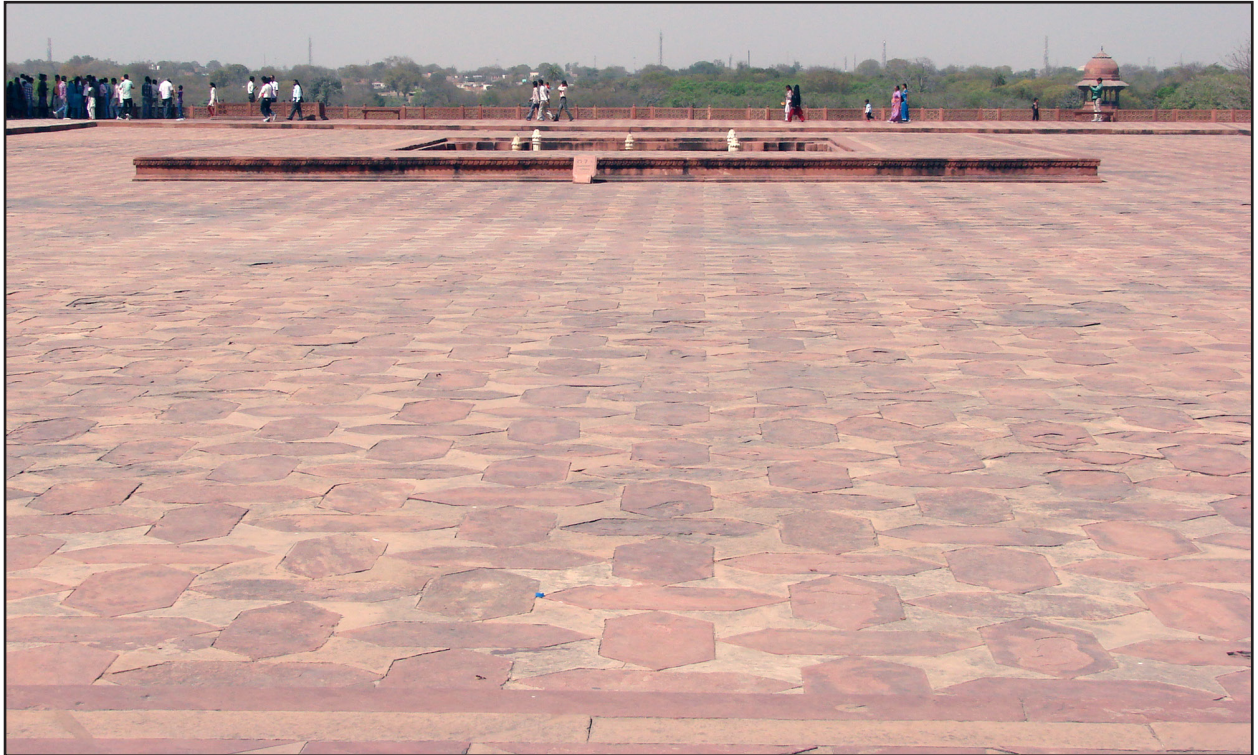
Fig.1. Great stone platform expanded surrounding the tomb and is dominant over the garden. Humayun tomb-garden, Delhi. Photo: Mehrdad Soltani, 2012.