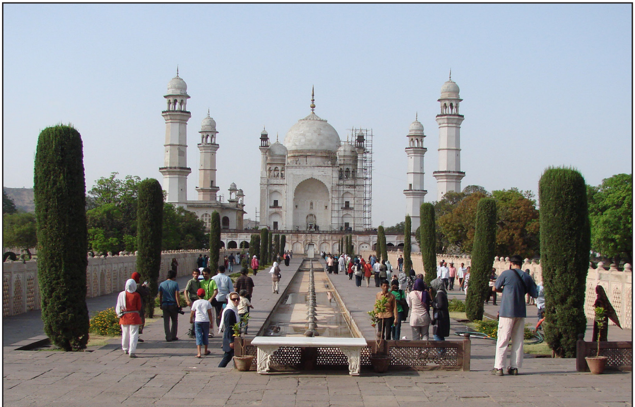
Fig.8. Stone wall on both sides of the main axis in Bibi-ka garden tomb has made it similar to an alley. Bibi-ka tomb-garden, Aurangabad. Photo: Mehrdad Soltani, 2012.