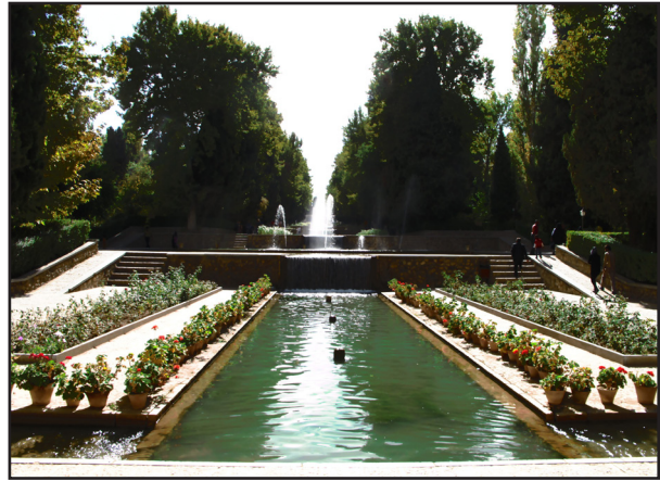
Fig.3b. Despite the width of the street in Persian garden, its soft landscape shows off. Princess Garden, Mahan. Photo: Seyed Amir Mansouri, 2013.