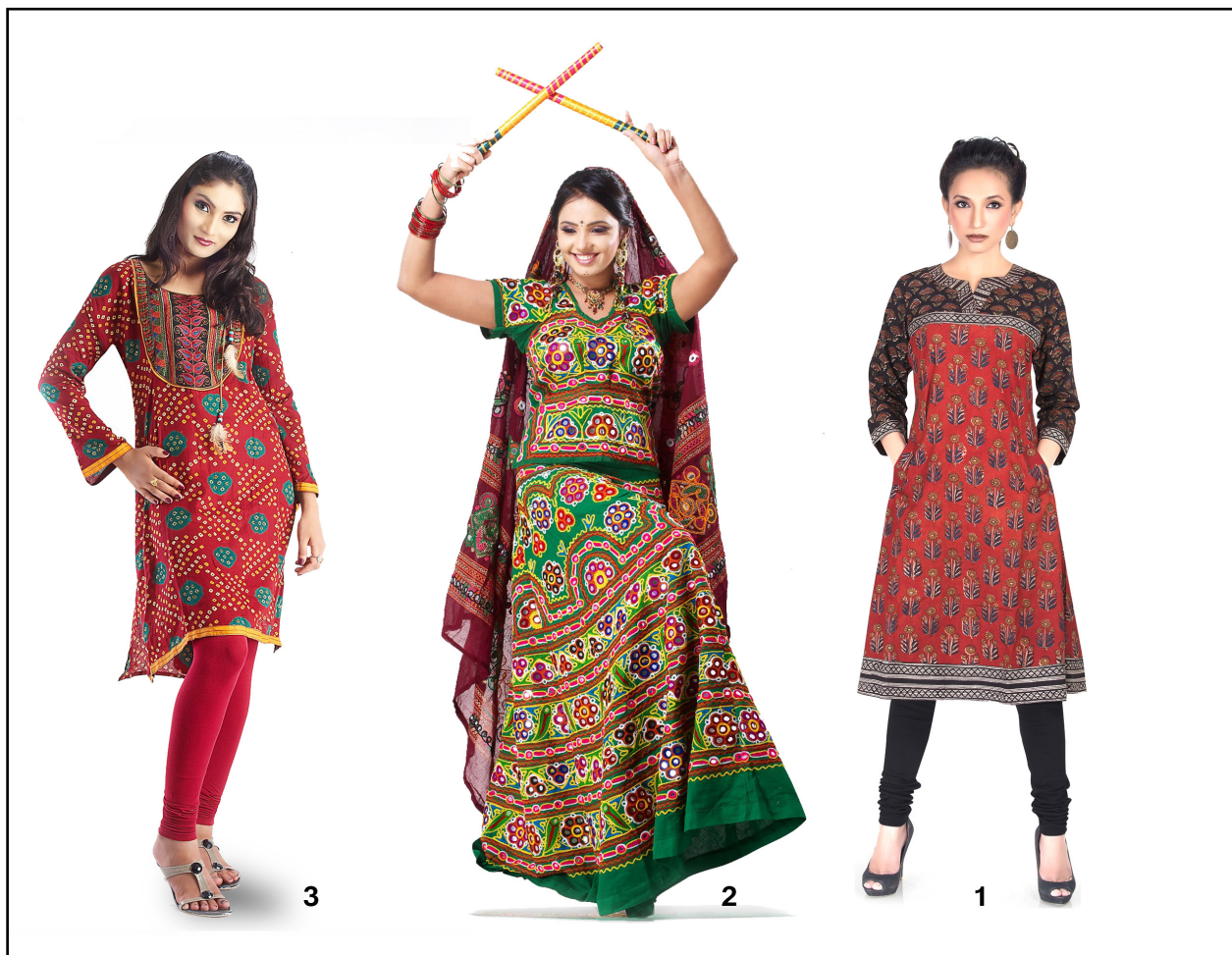
Fig.4. Examples of Indian women garments. 1.salwarkameez 2.Ghagracholi 3.Kurta.