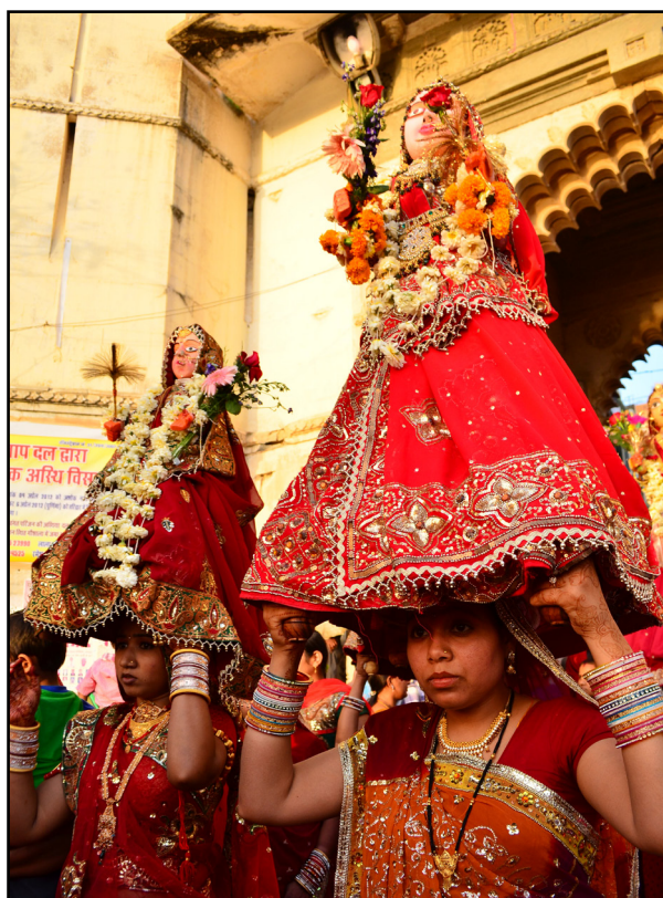
Fig. 1. The symbolic wedding ceremony of “Shiva” and “Pavarotti”. The garment of women who carry the poppets, is traditional Indian style, Udaipur, India. Photo: Shahrzad Khademi, 2012.

“Cultural landscape is dynamic and collaborative” Based on world heritage of UNESCO definition. Cultural landscape is clearly distinguishable from people active intervention. In actual fact, based on urban landscape definition, cultural landscape is formed by human presence and its quality whether physically or his impression on his environment. It can be perceived that people with his particular clothing make space legible and identified. It’s not the only factor which makes a space identified, but it’s one of the most important features in city’s cultural landscape. India is one of the countries which have arranged various actions to protect its cultural landscape. Preserving women clothing is one these actions. Despite passing historical periods, arriving modernism, women presence in social activities, Industrial development in India and so forth, still we can see Indian, specifically