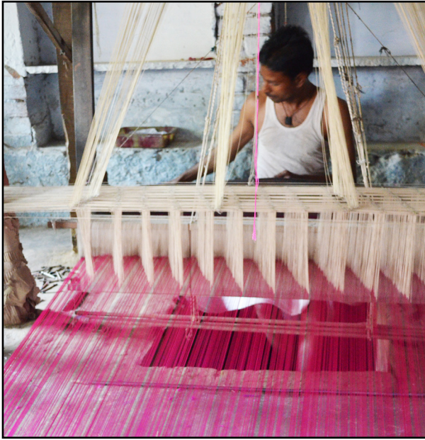
Fig.3. Small knitting fabric workroom associated with cheap labor, are among the factors which made textile industry prospered in India.