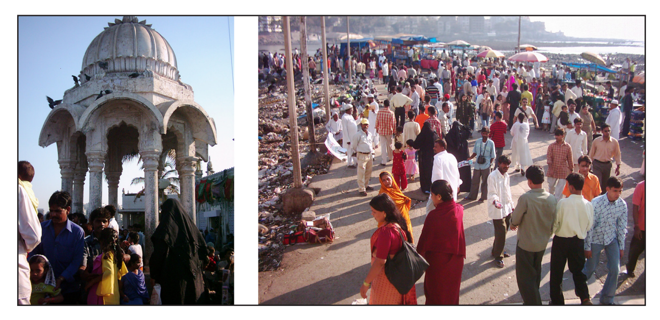
Figs 2 & 3. Muslims and Hinus in Haji Ali Dargah, Mumbai, India.