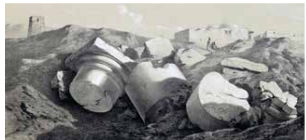
Fig. 6. The ruins of columns relevant to the temple so-called as Anaitis in Kangavar

the Anaitis Temple in Bishapur (Azarnoush, 1981). Thus, drawing on the available archaeological dataset, the function of this monument, originally comprising a large portico with lateral staircases and gigantic stone rails all around it, should be reconstructed with reference to the natural landscape of the surrounding plain, which suggests that it might have been originally a daskereh or a royal summer residence, quite contrary to the current moniker Anaitis Temple. This seems to be a particularly fitting interpretation as far as the existing indications at the Sassanid sites of Sarab, Farhad Tarash and even Qasr-e Shirin in the Kermanshahan region are concerned (Ajourloo, 2010). 1