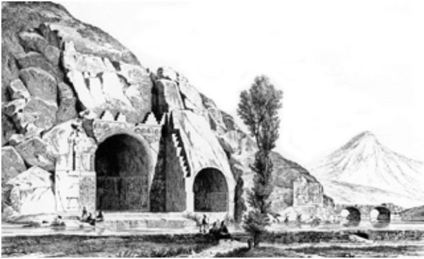
Fig. 4. The Eyvan-e Taq-e Bostan in Kermanshahan.

the king and the royal family during their gaming pleasure. The mutual concordance between the elements of natural landscape and the representations of the goddess Anaitis, all of which were revered in the Mazadism cult of early Iran, should also be emphasized (Ibid).