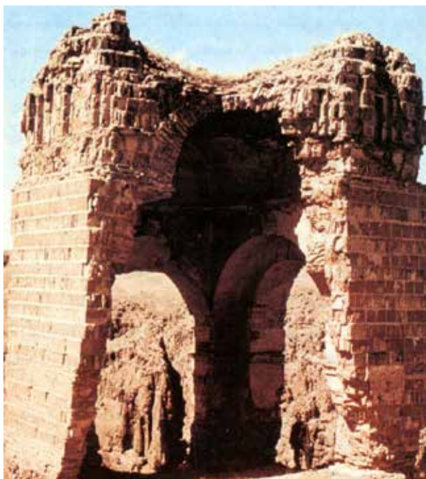
Fig. 1. The tetrapylon of Qala Zah'hak in Azerbaijan .

attributed to Shapur I, Shapur II and Peruz (Mansouri & Ajorloo, 2008). A gilt plate in the Louvre displays Khosrow II (Khosrow Parvez) hunting a bear and stag, and on the silver one in the Hermitage the Sassanid Shapur II chases a lion (Ghirshman, 1962). The scene of boar hunting seen in a Sassanid fresco deriving from Susa or the Sassanid Peruz Shah in a boar hunting scene represented on the stucco decorations from Chal'tarkhan in Rayy (Ibid) are reminiscent of the scenes in which Khosrow II waits in ambush for a boar in Taq-e Bostan. It is important to note, however, that these representations all have their origins in the depiction of boar hunting in the Parthian art, as an example of which I cited above the fresco of Dura-Europos. Sassanid kings hunting anecdotes are also reflected in historical texts. In particular, Shapur I's inscriptions in Haji'abad of Persia and Tang-e Boraq relate the story of the emperor's zebra chasing and his mastery of hunting and shooting (See Amouzegar & Tafazzoli, 1996). Other than the Sassanid artworks dealing with hunting, archaeological evidence from the historical Kermanshahan region corroborates the existence of royal hunting ground palaces or hunting pavilions, which were required by the prevailing