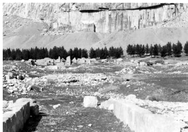
Fig. 2. The incomplete panel of Farhad Tarash in Bisotun.

The incomplete carving work at Farhad Tarash seems to have initially been intended as a panel for a big inscription (Fig. 2), and there was presumably a building complex consisting of a fountain, garden and a Sassanid palace or hunting pavilion. The carved wall of Farhad Tarash at the base of Bisotun Mount together with the installations and the plan of the building discovered in the village of Bisotun lying opposite Farhad Tarash evince a daskereh or a royal hunting ground of a Sassanid date whose construction presumably followed the plan of the Persian style of gardens. It is important to note, however, that the complex could be interpreted as a royal hunting ground only with reference to the Khosrow's palace in Kangavar (reputedly known as Anaitis Temple), Sarab of Taq-e Bostan in Kermanshah, and the Khosrow's palace in Qasr-e Shirin (Mansouri & Ajorloo, 2008). Farhad Tarash was assigned to Khosrow II by Luschny and Erdmann attributed it, by analogy to the Sassanid monuments in Taq-e Bostan, to Peruz (Ibid). However, according to W. Salzmann, the Sassanid architects had planned to carve on this 200 x 33 meters wall an Eyva , similar to the Eyvan-e Kasra of Ctesiphon and larger than those in Sarab of Kermanshah, as well as some scenes on both sides of the large Eyva (Salzmann,